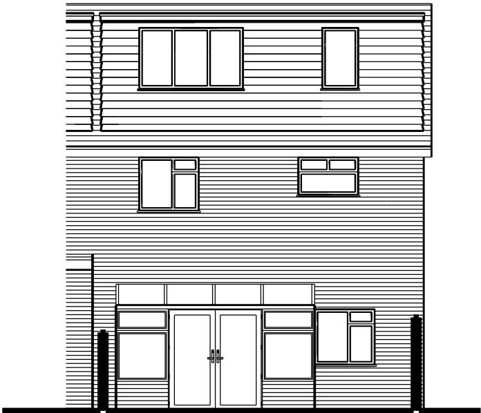
02 PROPOSED REAR ELEVATION SCALE 1:100