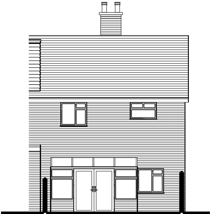
01 EXISTING REAR ELEVATION SCALE 1:100

NOTES: All construction to comply with all relevant and current building regulations. For building regulation compliance please refer building regulation/ structural engineers drawing. All Dimensions to be measured by contractor on site prior to construction. Not for construction.