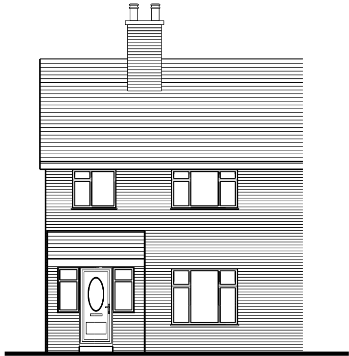
01 EXISTING FRONT ELEVATION SCALE 1:100

NOTES: All construction to comply with all relevant and current building regulations. For building regulation compliance please refer building regulation/ structural engineers drawing. All Dimensions to be measured by contractor on site prior to construction, Not for construction.