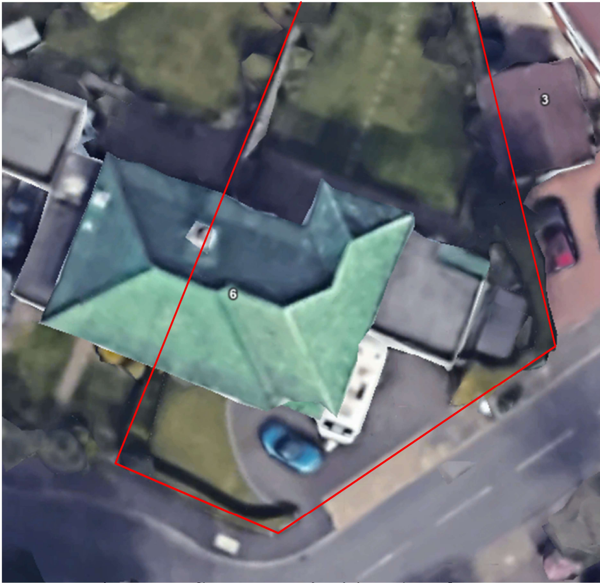
AERIAL VIEW Site shown in red

Description of proposed works Ground floor - Rear extension - Internal alterations