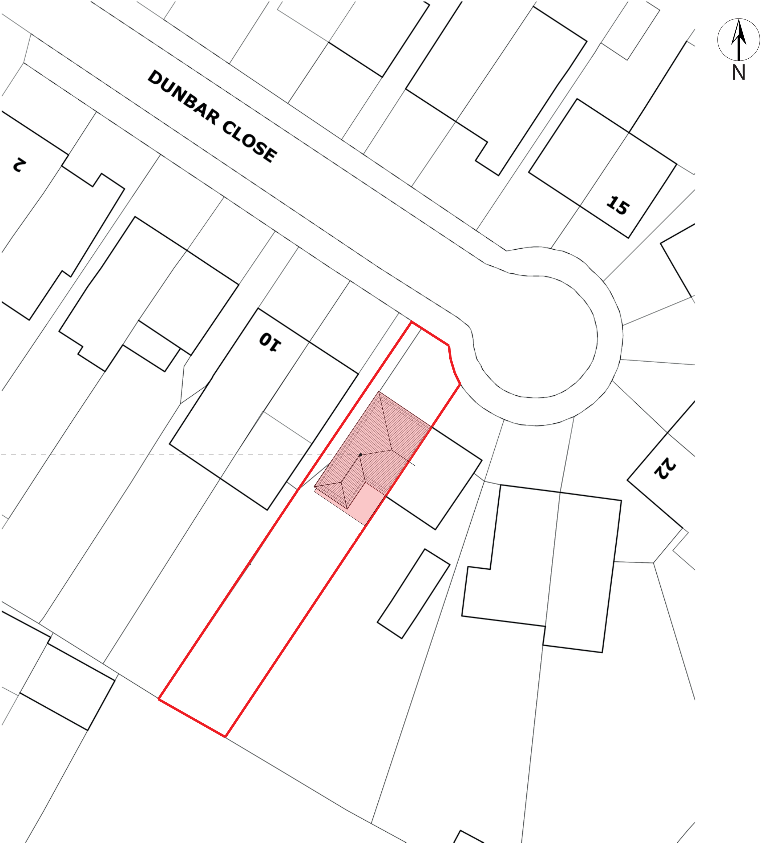
PROPOSED SITE BLOCK PLAN SCALE 1:200

PROPOSED GROUND FLOOR REAR EXTENSION, AND FIRST FLOOR REAR EXTENSION