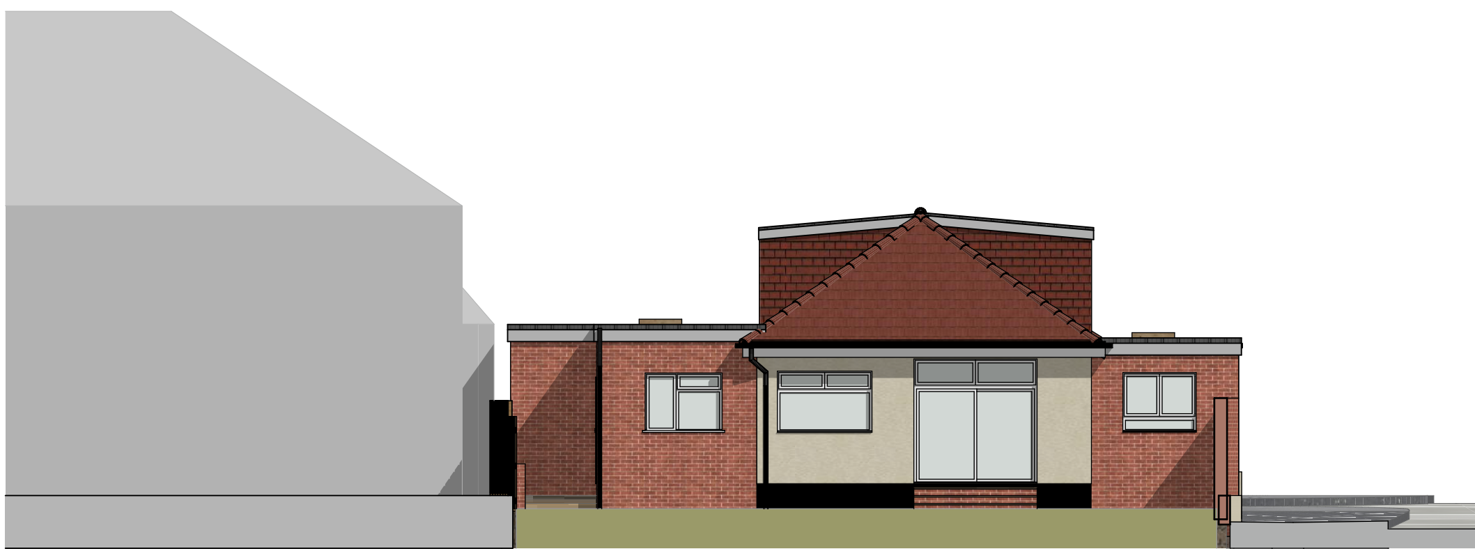
6 Rear Elevation 1:100