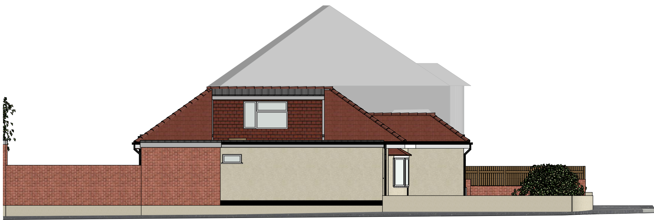
5 Side Elevation 1:100