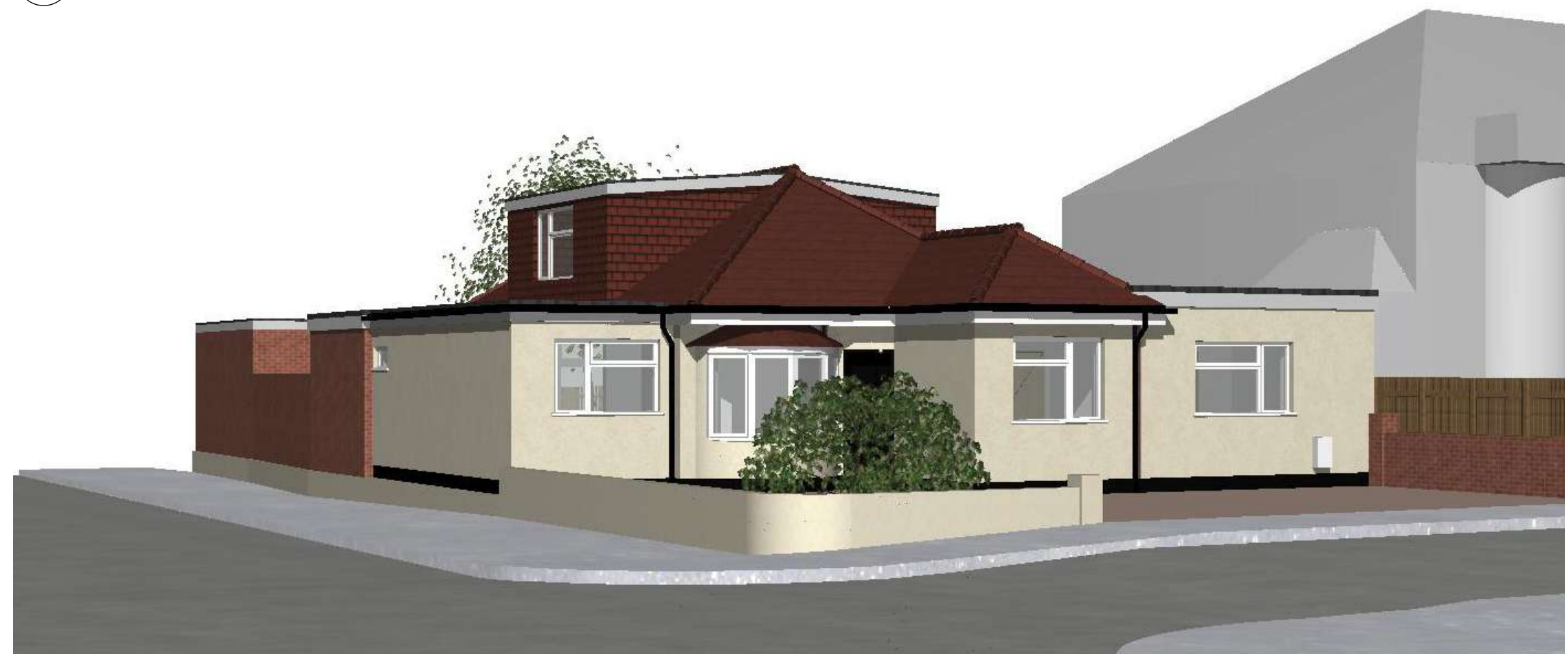
7 Street View 1:100