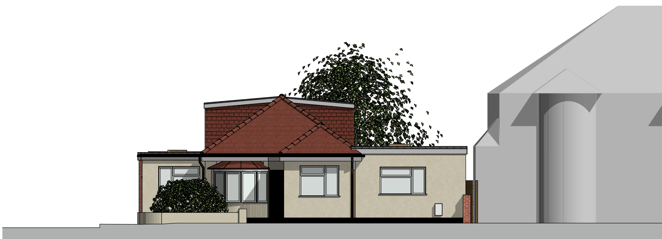
2 Front Elevation 1:100