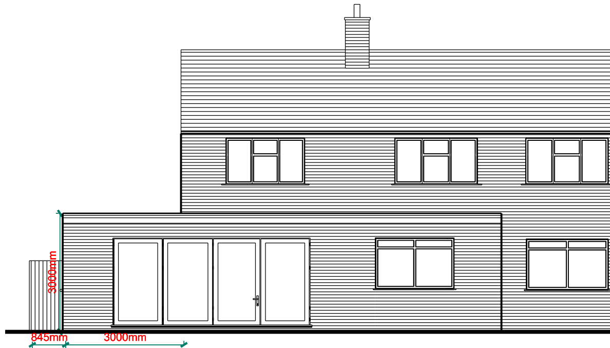
04 PROPOSED REAR ELEVATION SCALE 1:100