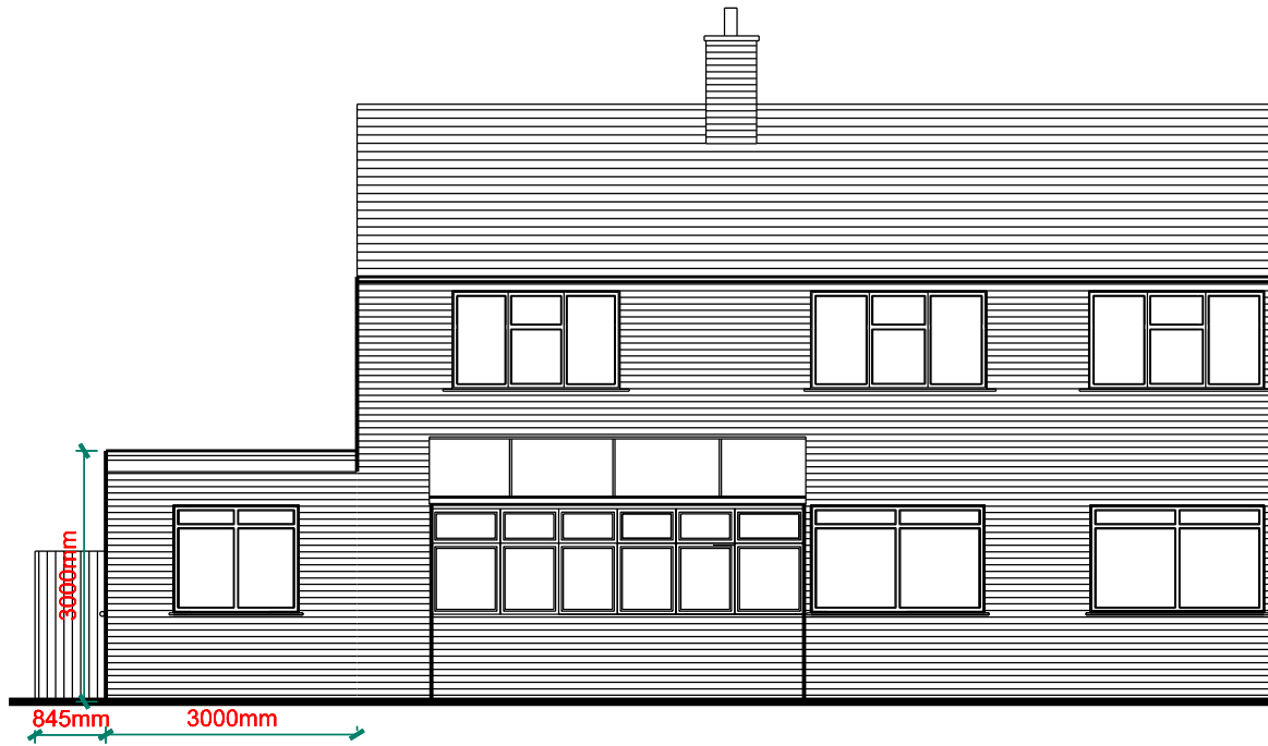
02 PREVIOUSLY APPROVED REAR ELEVATION APPLICATION REF : 17286/APP/2024/2117 SCALE 1:100