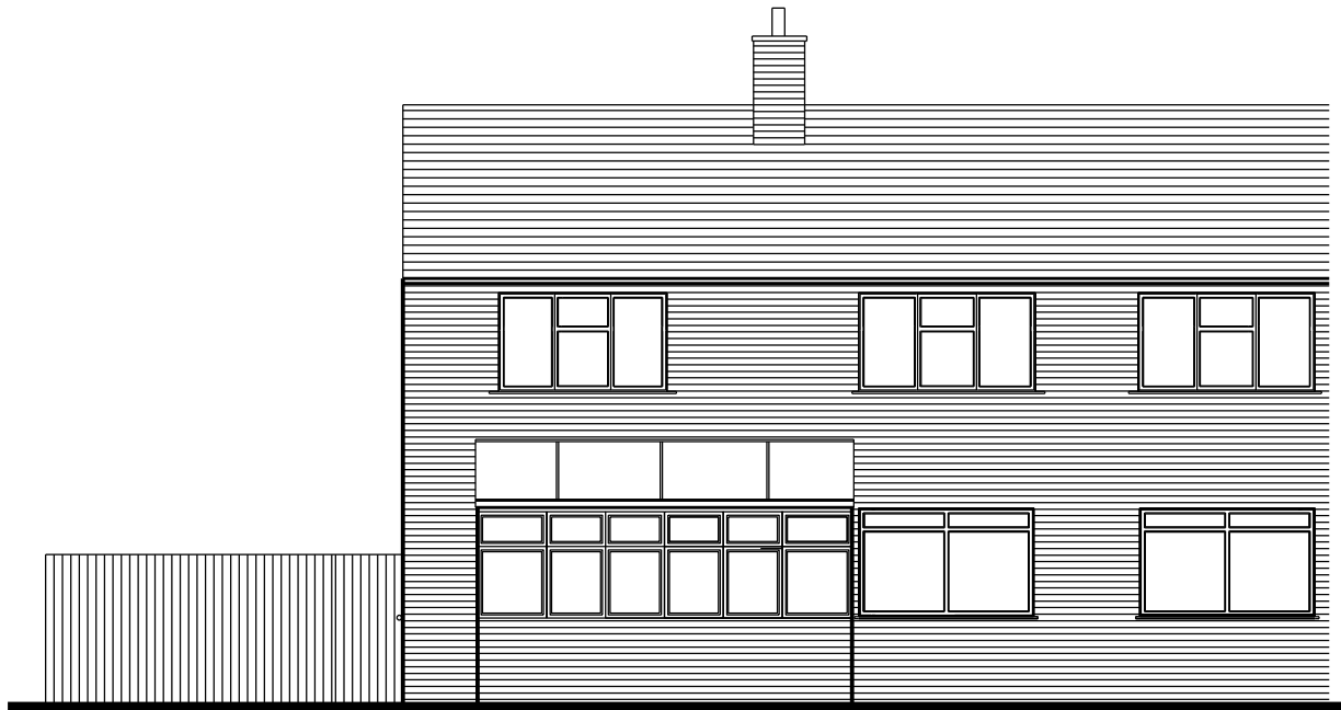
01 EXISTING REAR ELEVATION SCALE 1:100

NOTES: All construction to comply with all relevant and current building regulations. For building regulation compliance please refer building regulation/ structural engineers drawing. All Dimensions to be measured by contractor on site prior to construction. Not for construction.