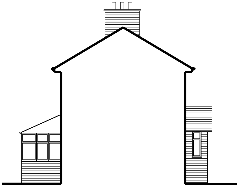
01 EXISTING SIDE ELEVATION SCALE 1:100

NOTES: All construction to comply with all relevant and current building regulations. For building regulation compliance please refer building regulation/ structural engineers drawing. All Dimensions to be measured by contractor on site prior to construction. Not for construction.