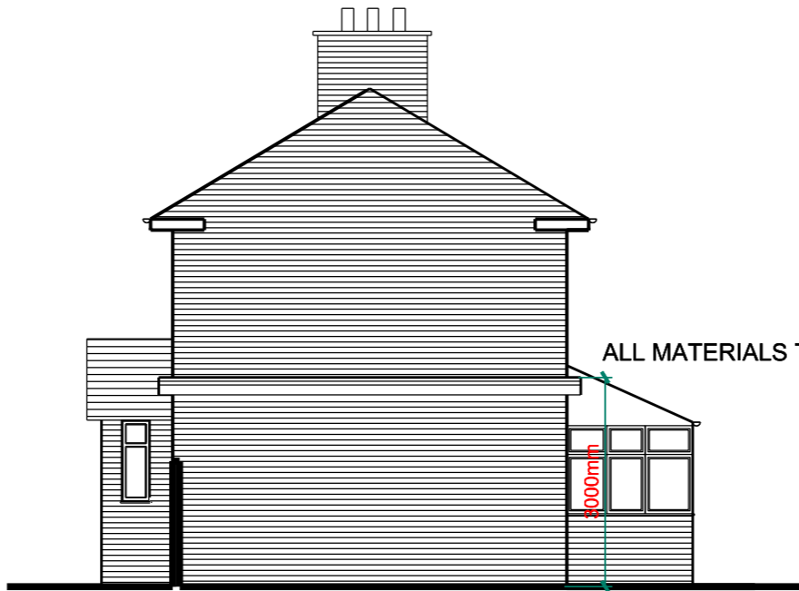
02 PROPOSED SIDE ELEVATION SCALE 1:100