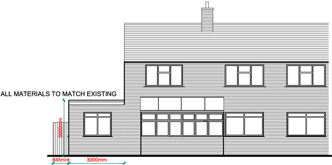
02 PROPOSED REAR ELEVATION SCALE 1:100