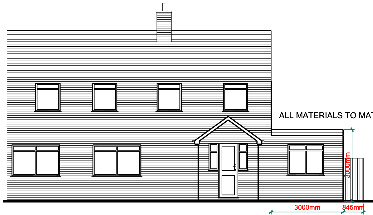
02 PROPOSED FRONT ELEVATION SCALE 1:100