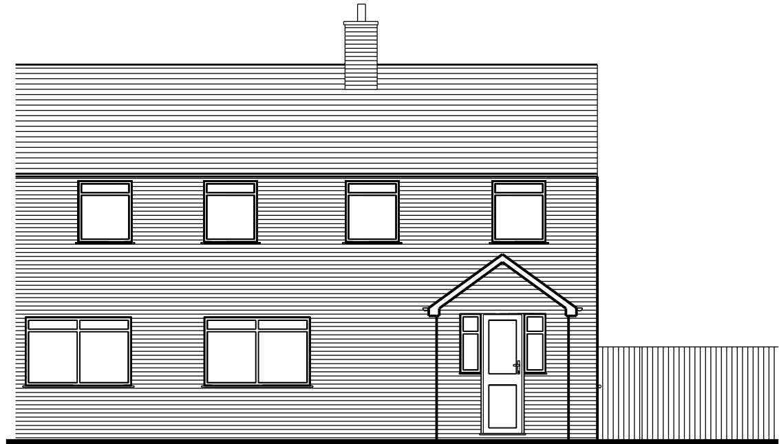
01 EXISTING FRONT ELEVATION SCALE 1:100

NOTES: All construction to comply with all relevant and current building regulations. For building regulation compliance please refer building regulation/ structural engineers drawing. All Dimensions to be measured by contractor on site prior to construction. Not for construction.