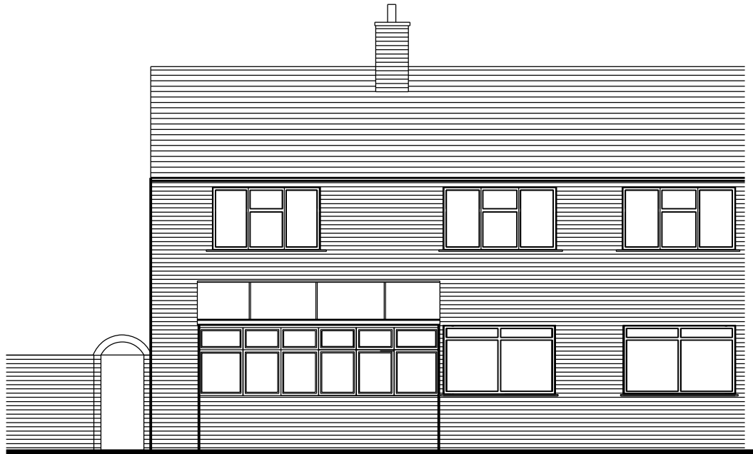
01 EXISTING REAR ELEVATION SCALE 1:100

NOTES: All construction to comply with all relevant and current building regulations. For building regulation compliance please refer building regulation/ structural engineers drawing. All Dimensions to be measured by contractor on site prior to construction. Not for construction.