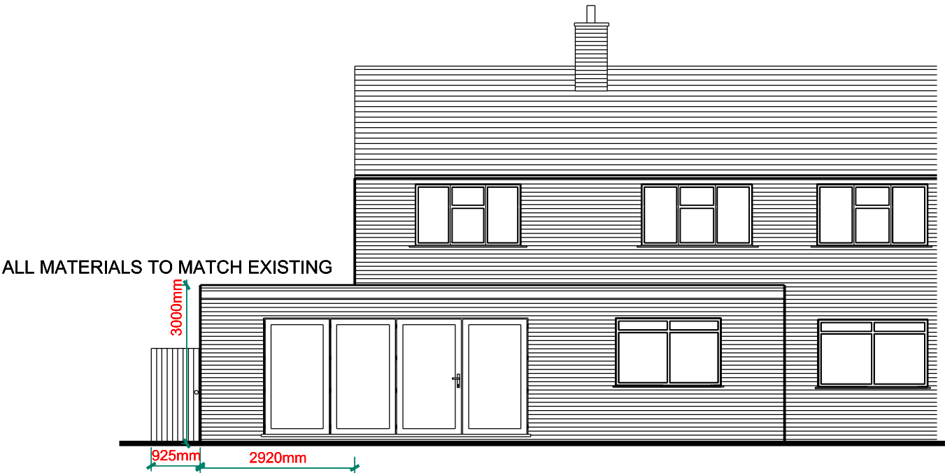
02 PROPOSED REAR ELEVATION SCALE 1:100