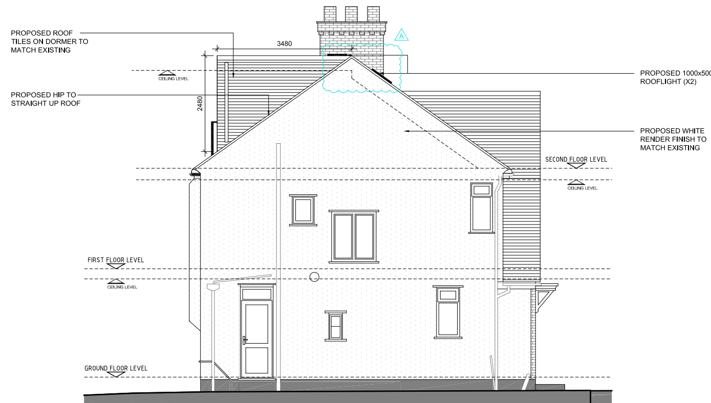
01 Proposed South Elevation 00-208 1:100@A3