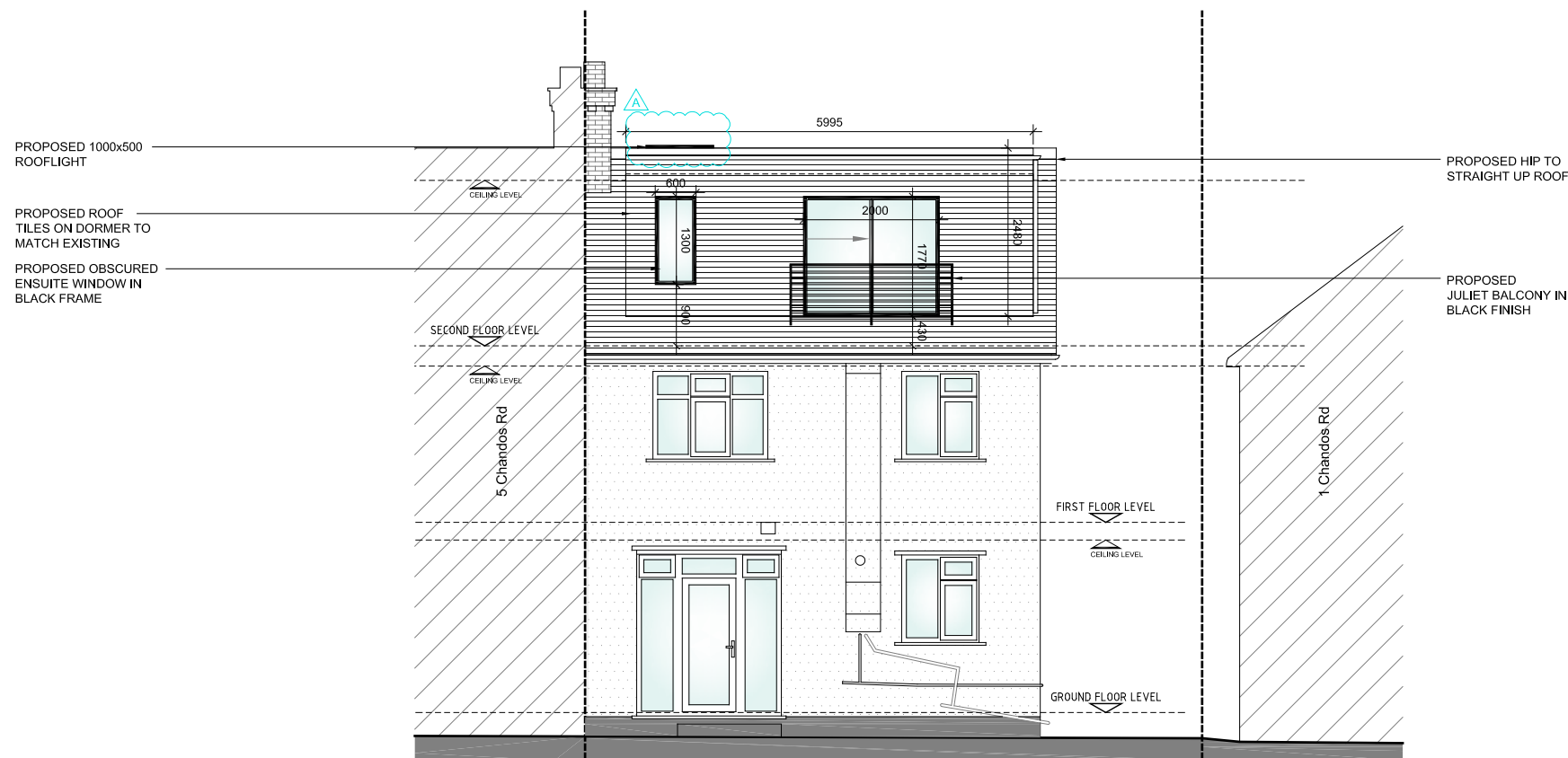
02 Proposed West Elevation 00-207 1:100@A3