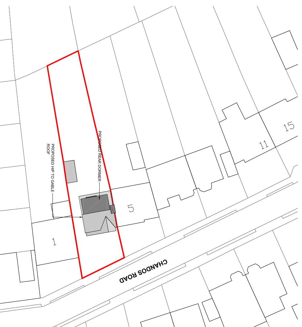
03 Proposed Site Plan 00-199 1:500@A3