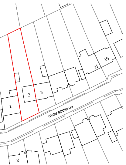
01 Location Plan 00-199 1:1250@A3