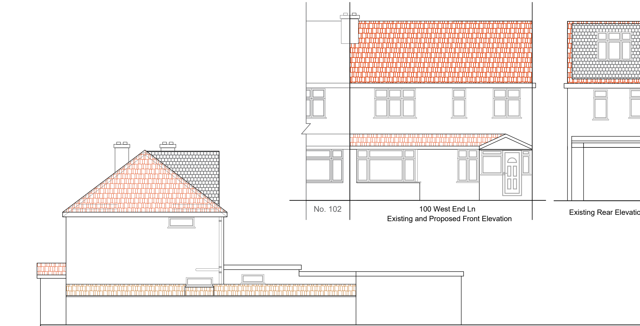
Existing Right Elevation