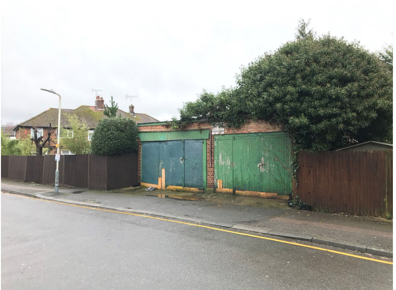
11. The view property opposite the application site.