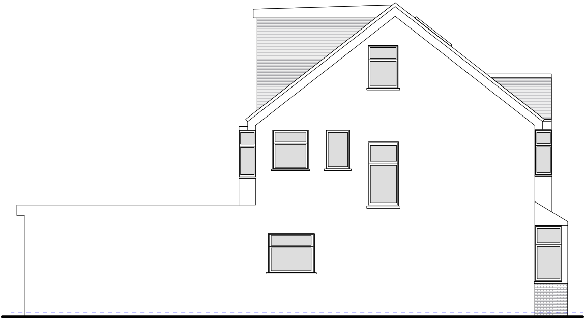
1 EX-20 SIDE ELEVATION PLAN Scale: 1/100