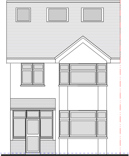
1 EX-20 FRONT ELEVATION PLAN Scale: 1/100