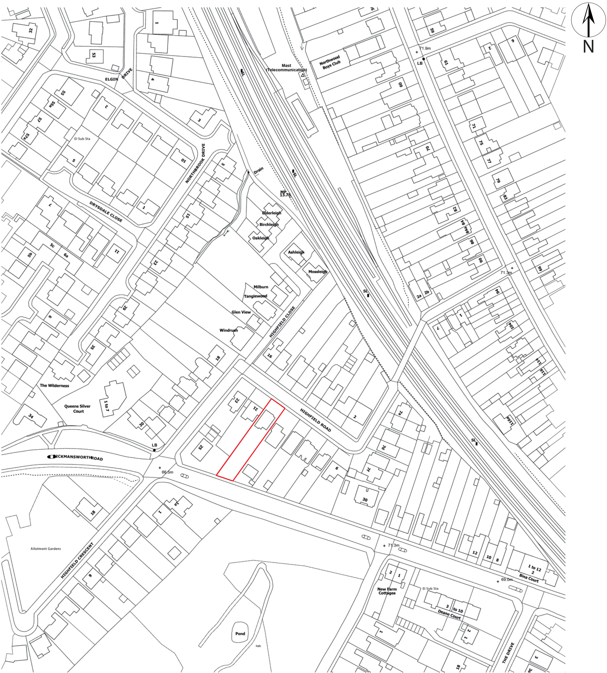
SITE LOCATION PLAN SCALE 1:1250 SITE BOUNDRY :