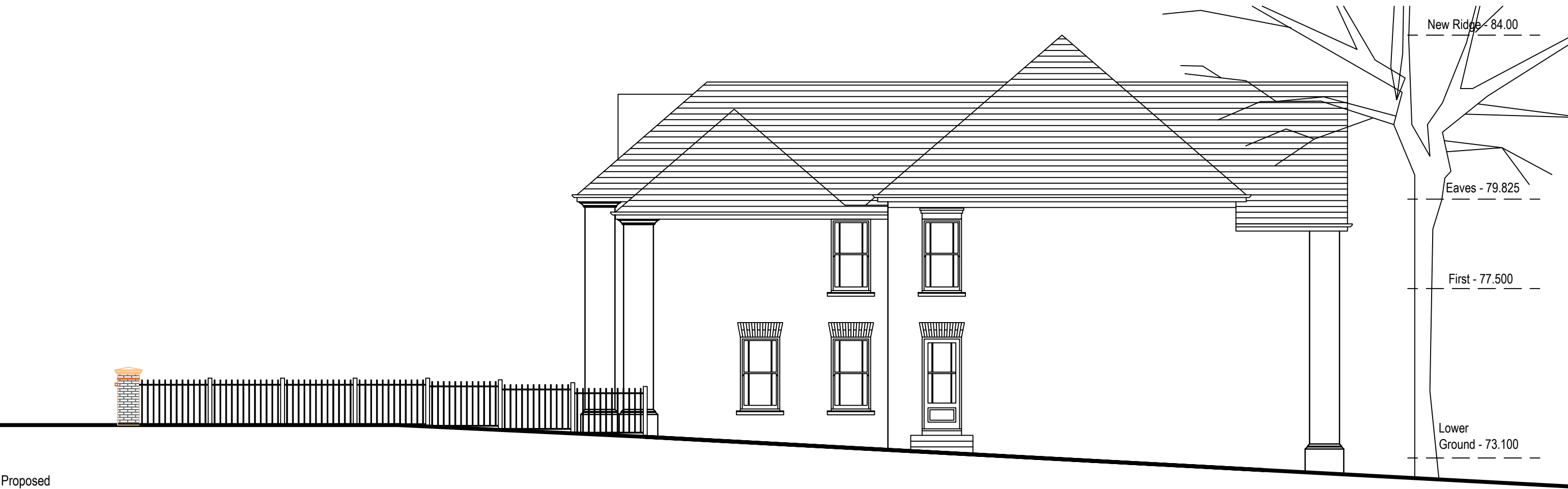
Proposed SIDE (South) ELEVATION Gate