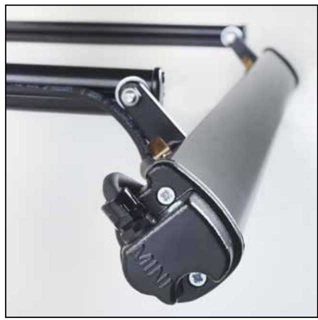
Example ecolux mini with 2 no. multi brackets