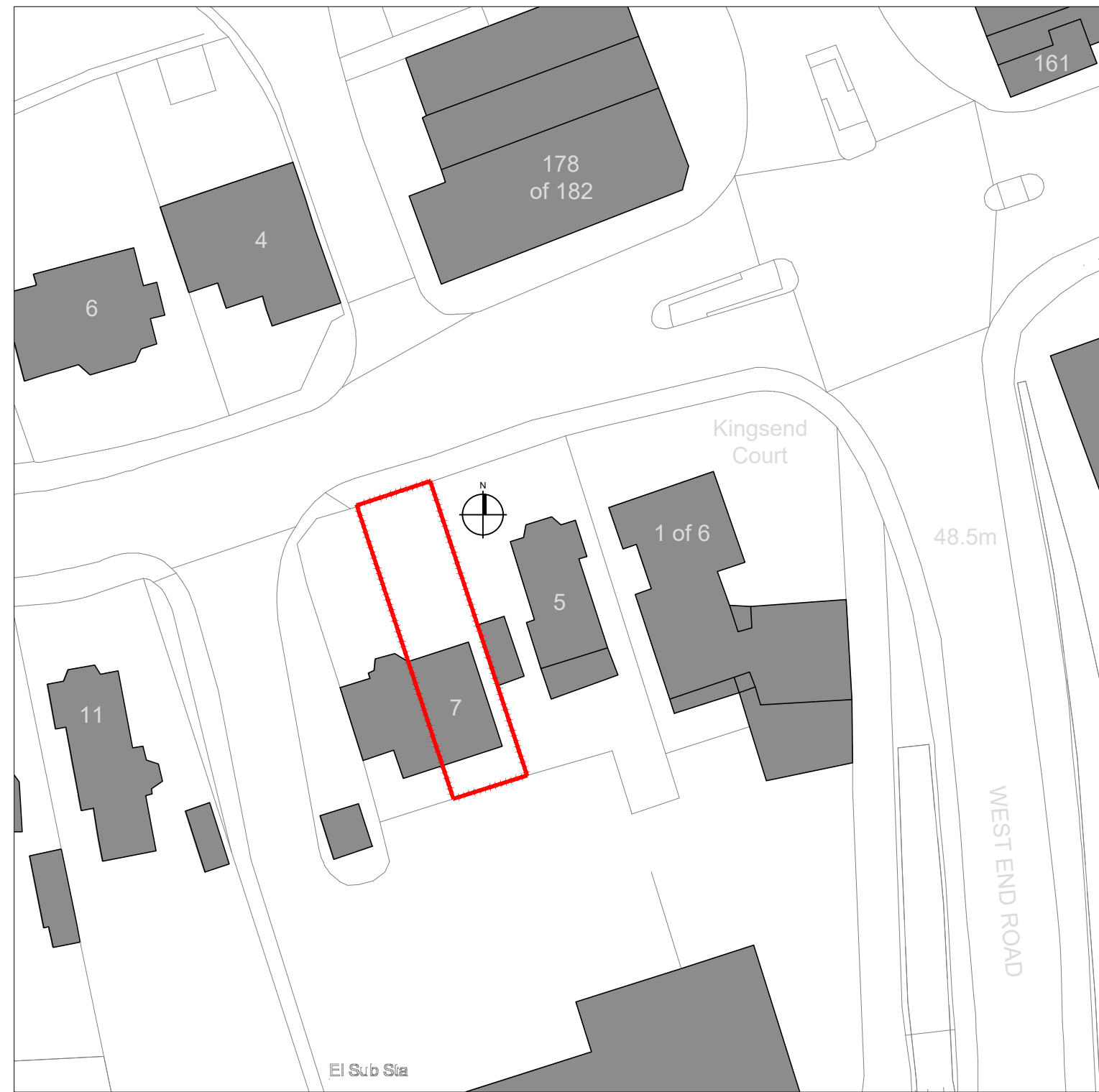
Location Plan 1:500 Scale Bar 1:500