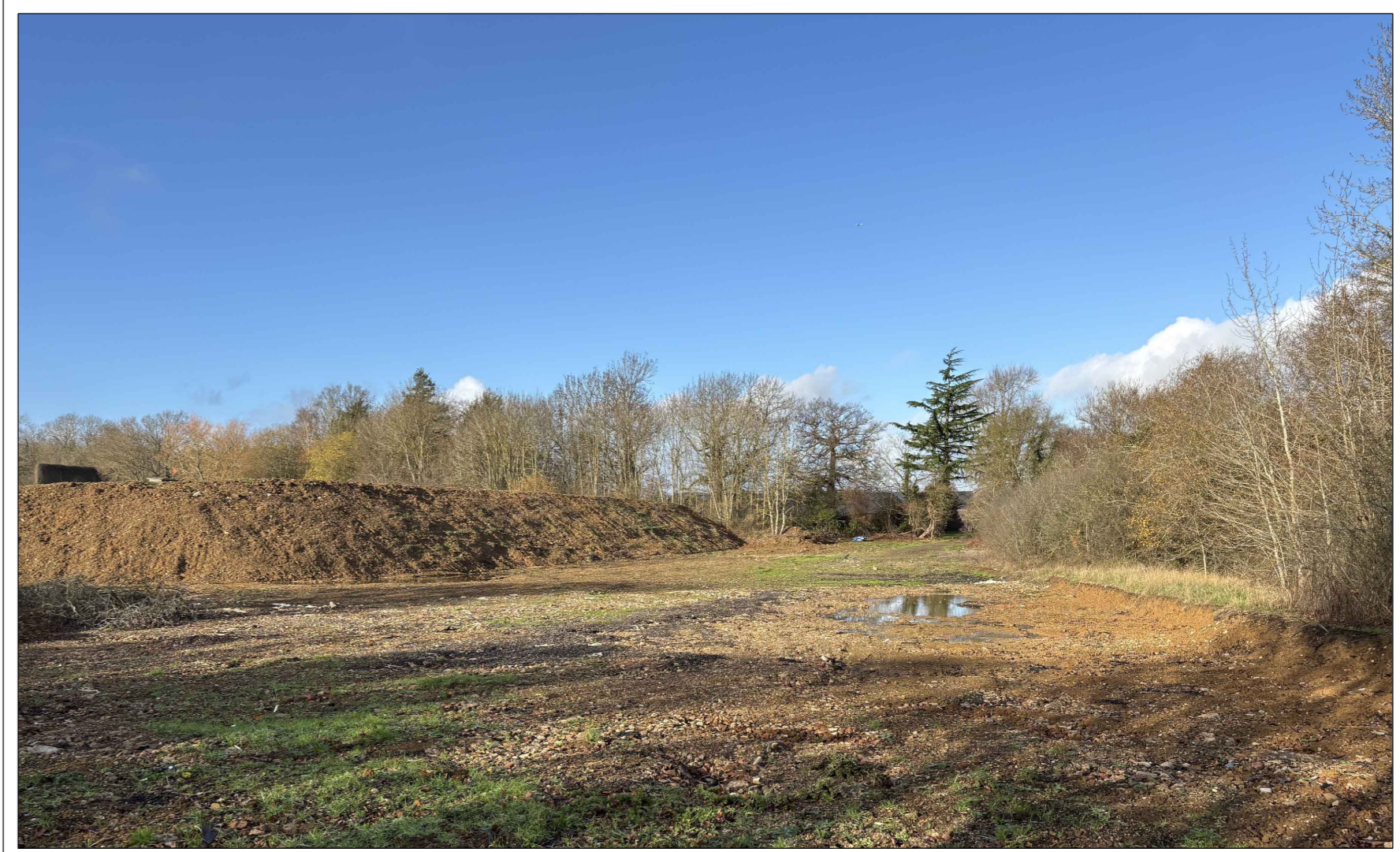
VIEW 1: SPOIL LOCATION 1 EXISTING DEPRESSION IN GROUND LEVEL CAN ACCOMMODATE ALL OF THE CONSTRUCTION SPOIL FOR THE PROJECT