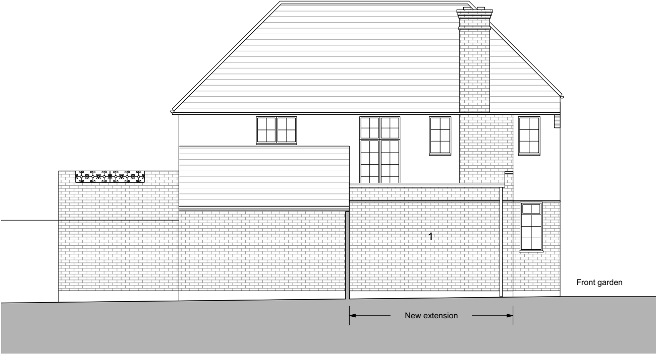
8 PROPOSED SIDE ELEVATION Scale: 1:100

Material legend 1. Red brick to match existing 2. uPVC windows