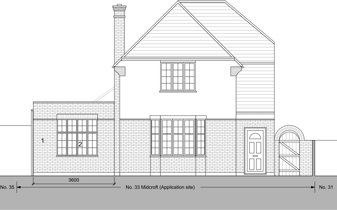
7 PROPOSED FRONT ELEVATION Scale: 1:100