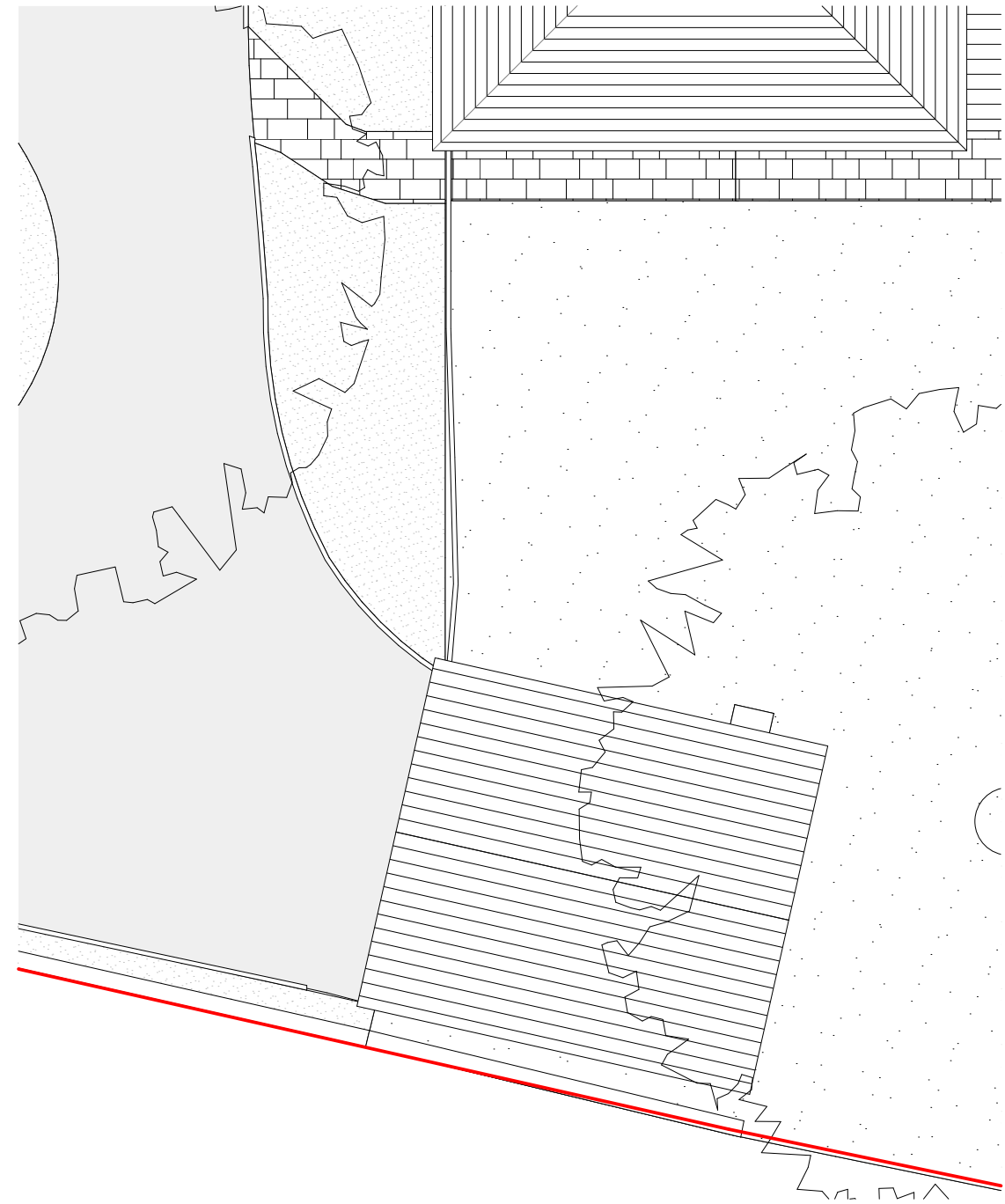
02 GARAGE ROOF PLAN AS EXISTING 1104 SCALE 1:100

Do not scale from this drawing. Use figured dimensions only. Figured dimensions are in millimetres. All dimensions and levels shall be verified on site before proceeding with works. Detailed site survey to be carried out to verify positions and level relationships with site features and ordnance survey. Boundaries are indicative only and to be verified by others. The architect must be notified of any discrepancy. Where building components are described in the specification as contractor designed, 'construction' information relating to those components on this drawing represent design intent only.