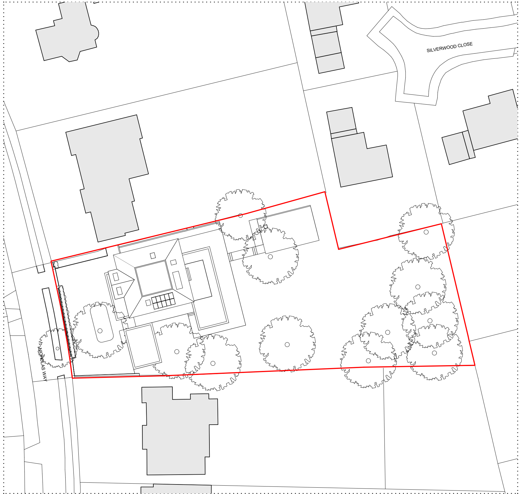
01 BLOCK PLAN AS PROPOSED SCALE 1:500