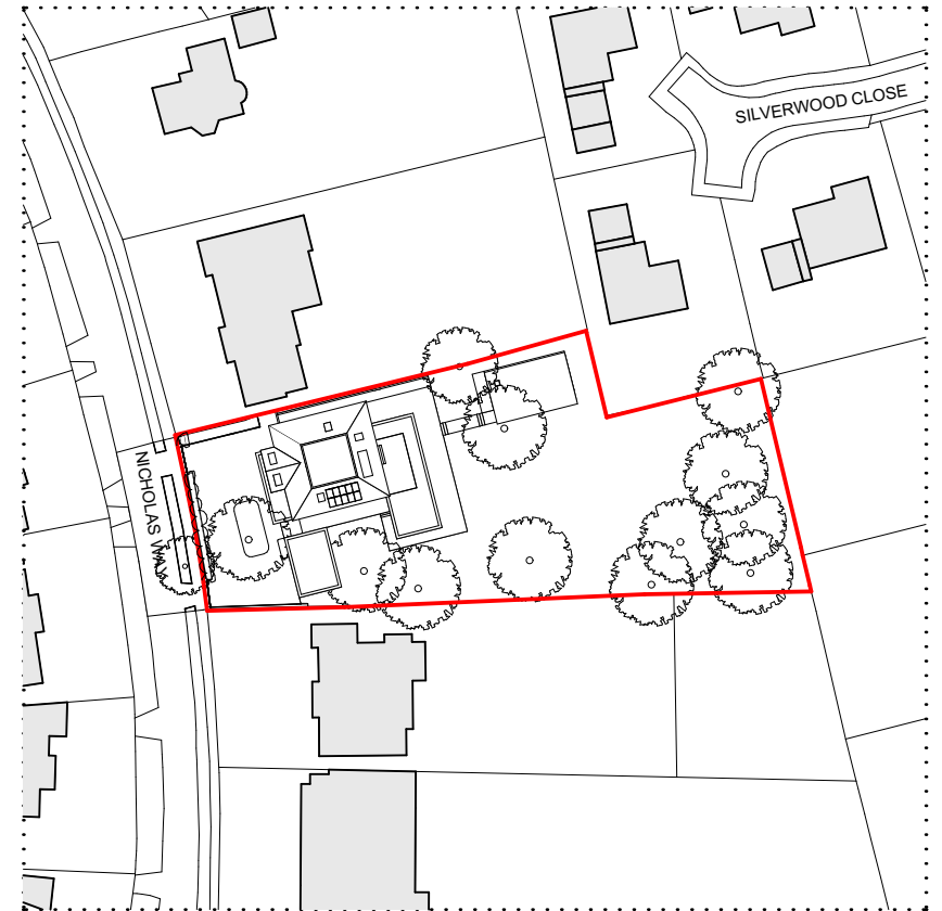
02 LOCATION PLAN AS PROPOSED SCALE 1:1250