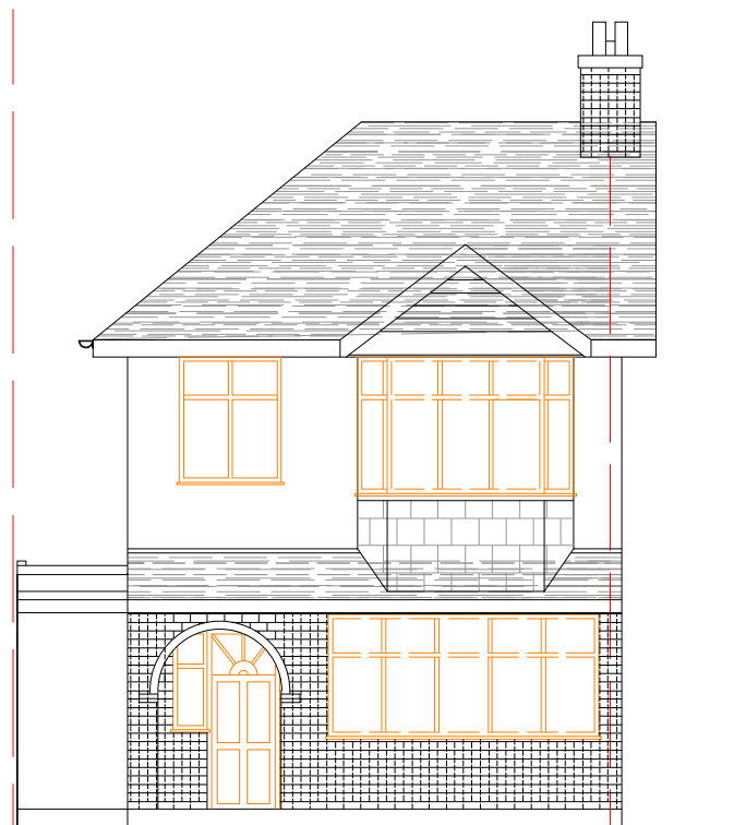
BEFORE BUILT FRONT ELEVATION SCALE:-1:100