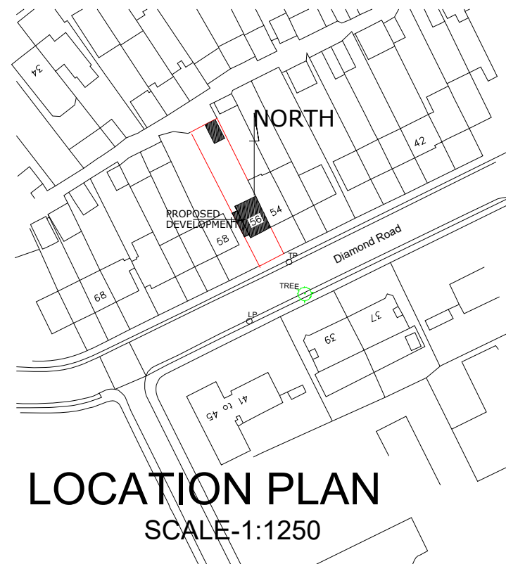
LOCATION PLAN SCALE-1:1250