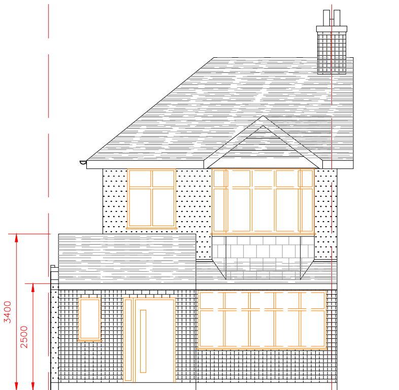
ASBUILT FRONT ELEVATION SCALE:-1:100