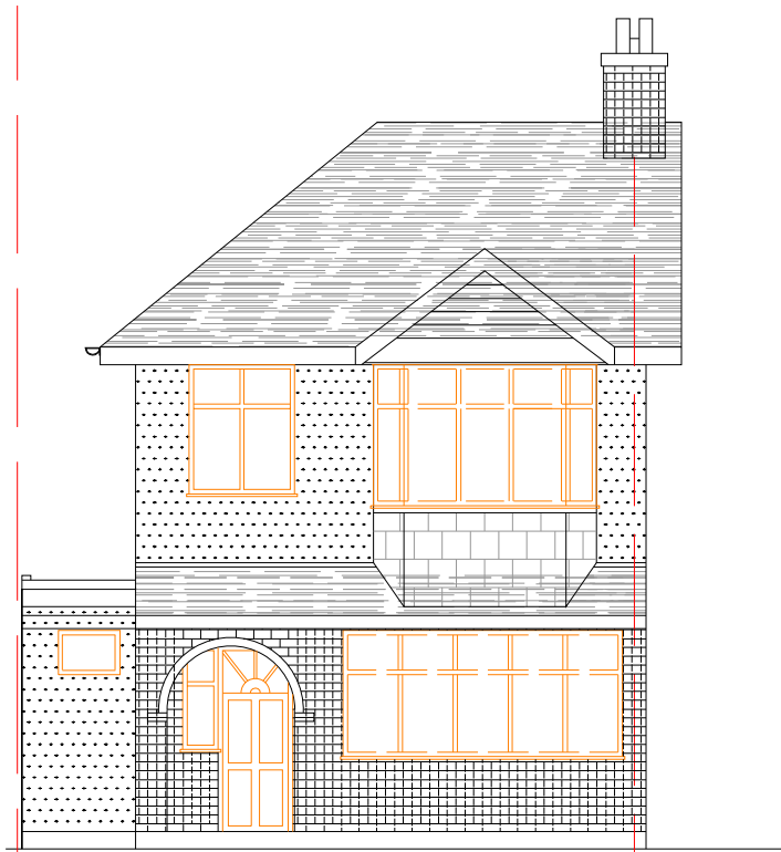
BEFORE BUILT FRONT ELEVATION SCALE:-1:100