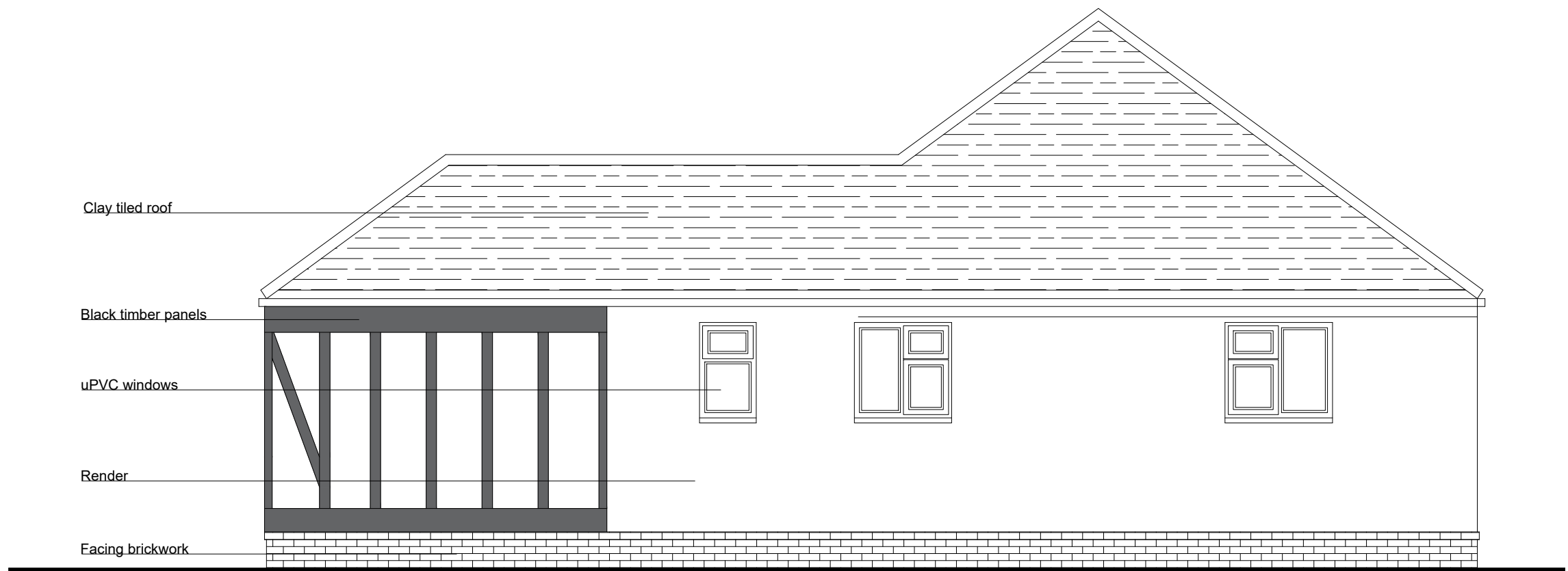
EXISTING SIDE ELEVATION D