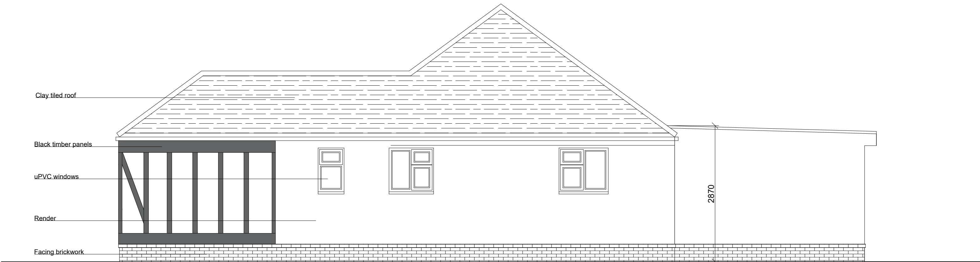
PROPOSED SIDE ELEVATION D