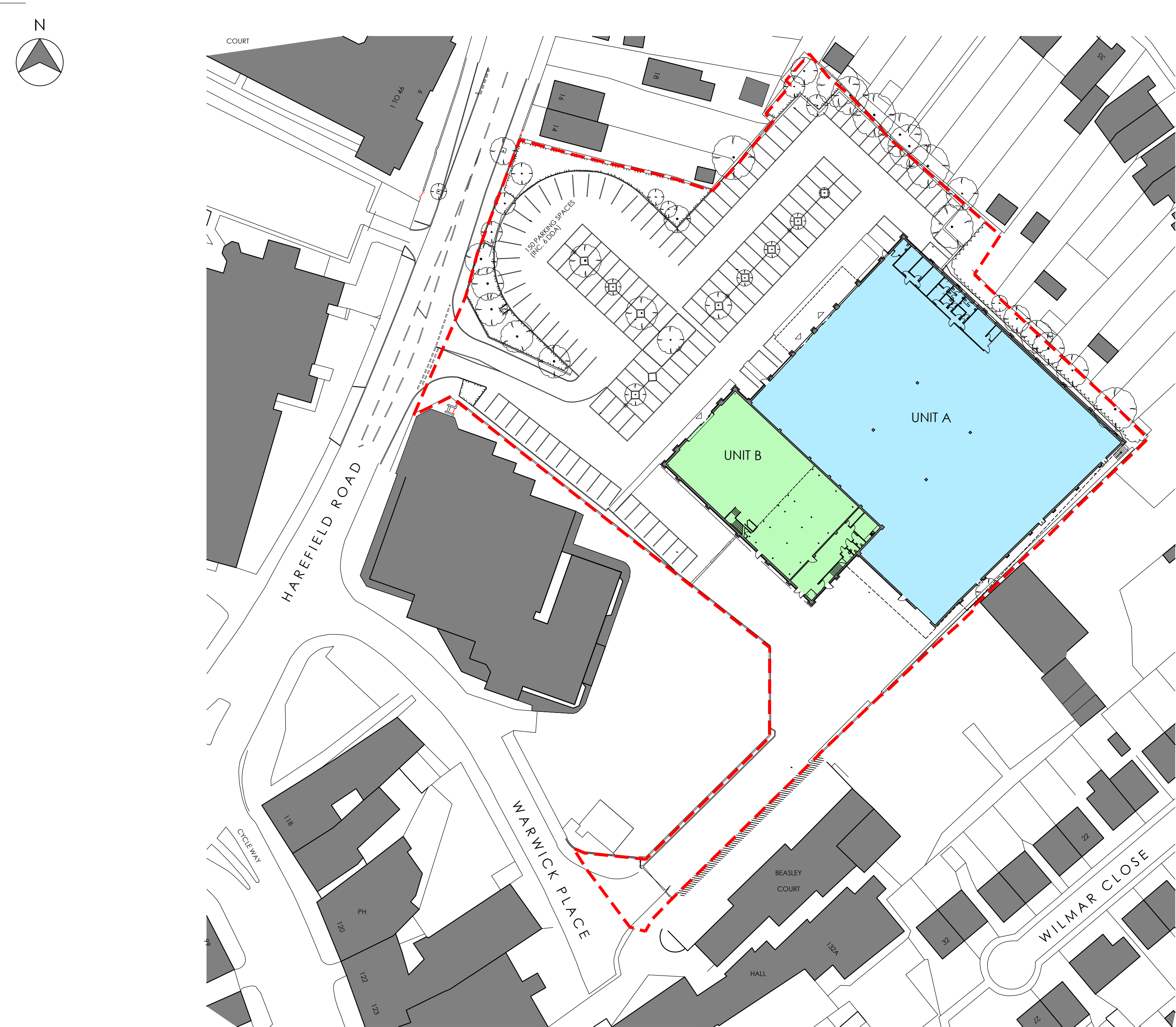
01 EXISTING BLOCK PLAN 1:500

ORDNANCE SURVEY, (C) CROWN COPYRIGHT 2019. ALL RIGHTS RESERVED. LICENCE NUMBER 100022432