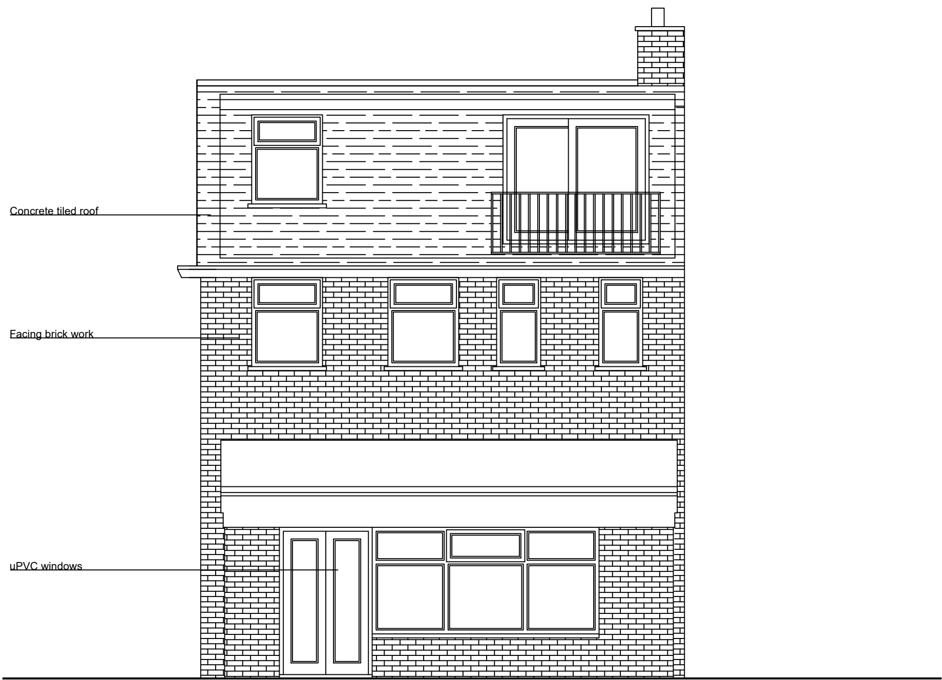
ELEVATION C PROPOSED REAR ELEVATION