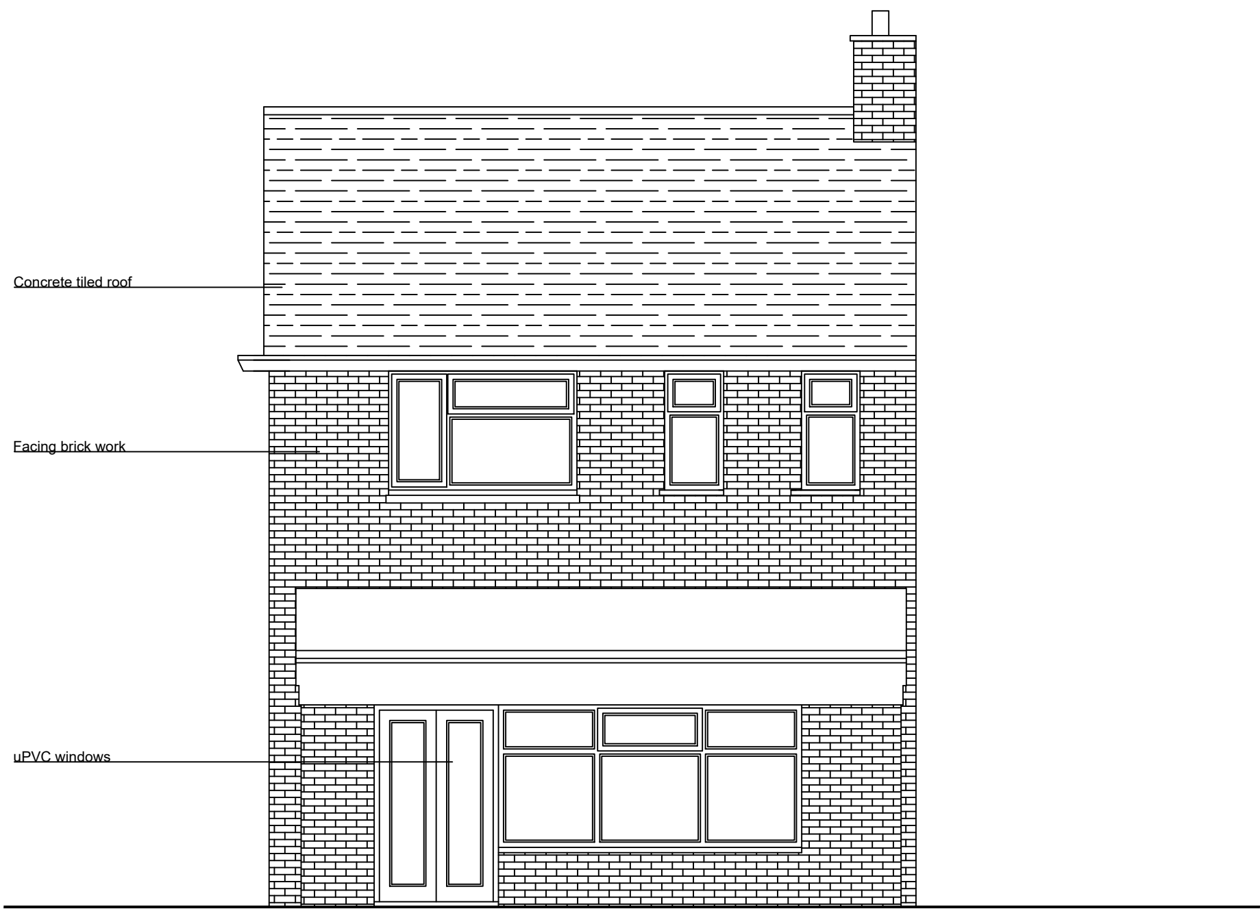
ELEVATION C EXISTING REAR ELEVATION