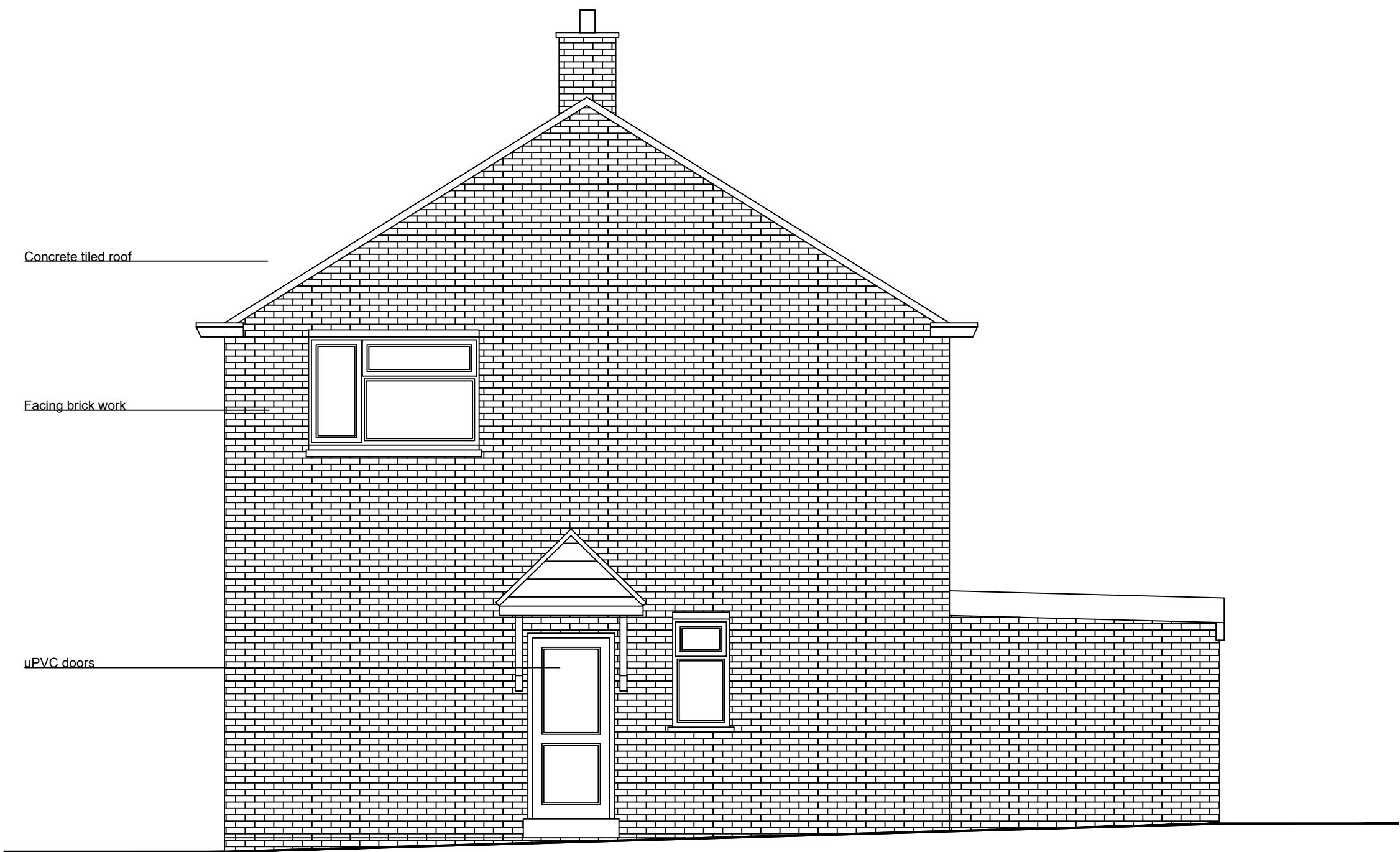
ELEVATION D EXISTING SIDE ELEVATION