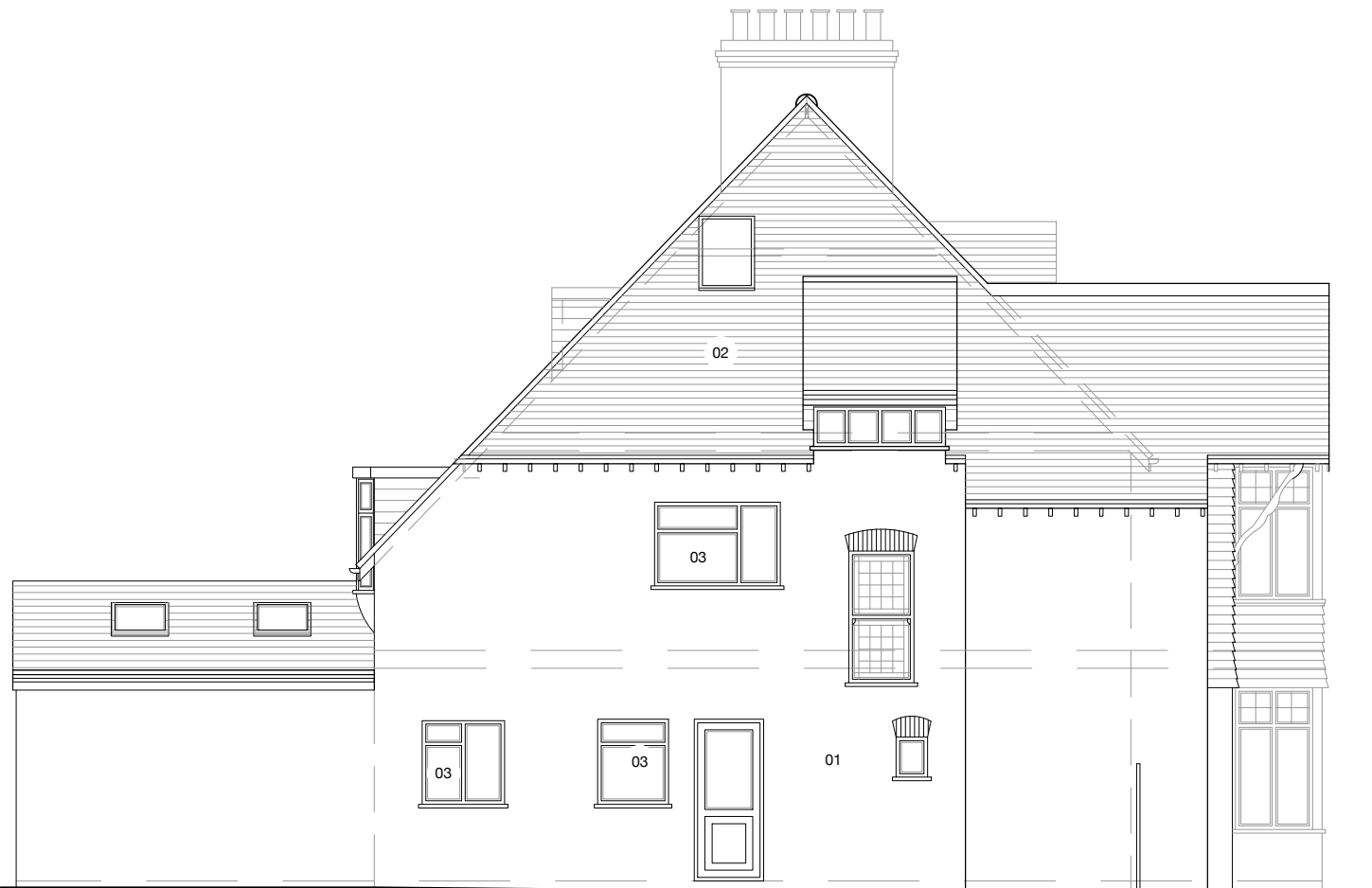
04 SIDE ELEVATION (NORTH) Scale 1: 100