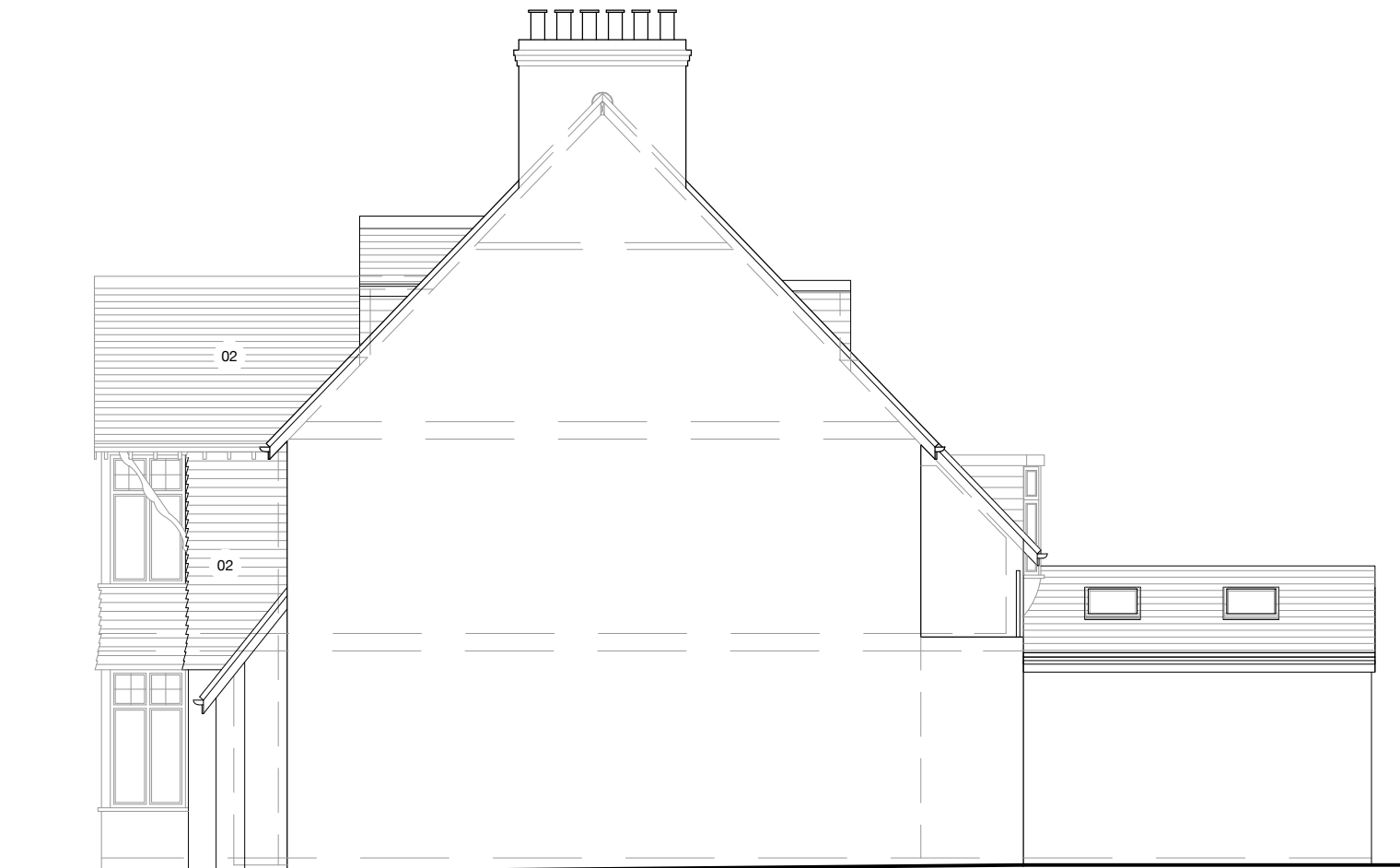
02 SIDE ELEVATION (SOUTH) Scale 1: 100