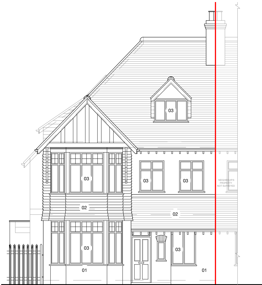
01 FRONT ELEVATION Scale 1: 100