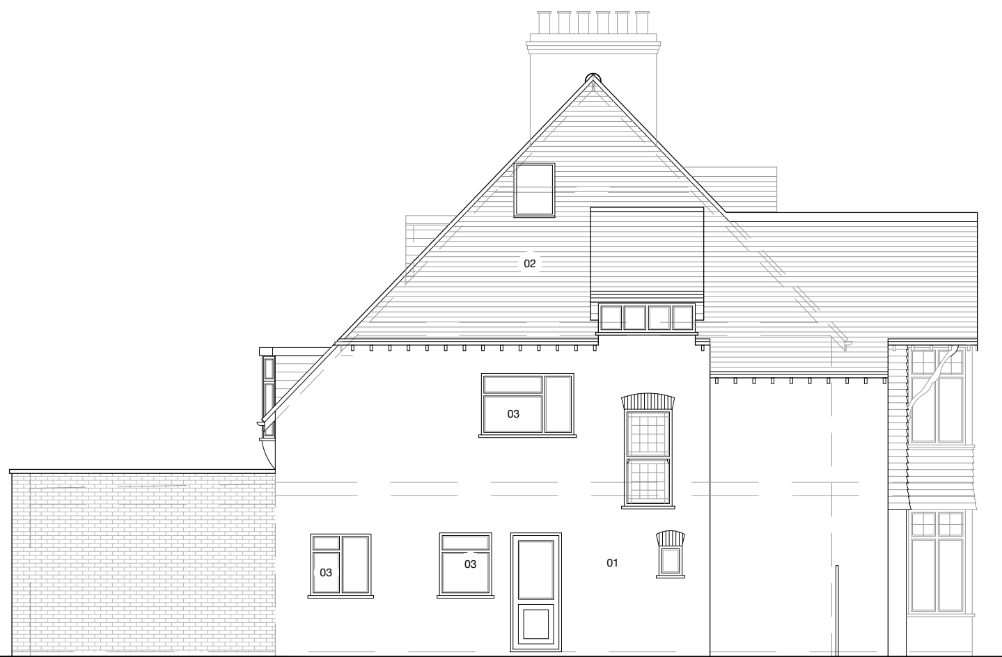
04 SIDE ELEVATION (NORTH) Scale 1: 100

A Rear Extension Amended 06.03.26 - First Issue dd.mm.yy