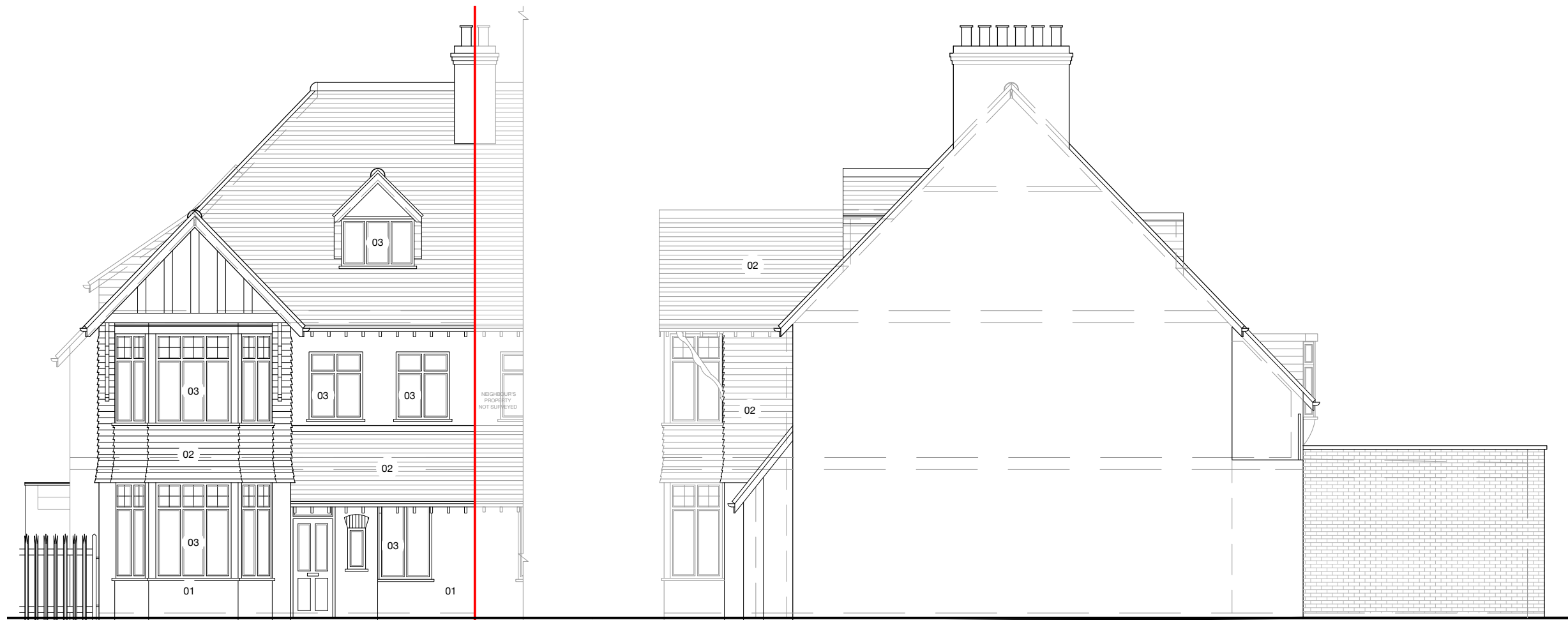
01 FRONT ELEVATION Scale 1: 100