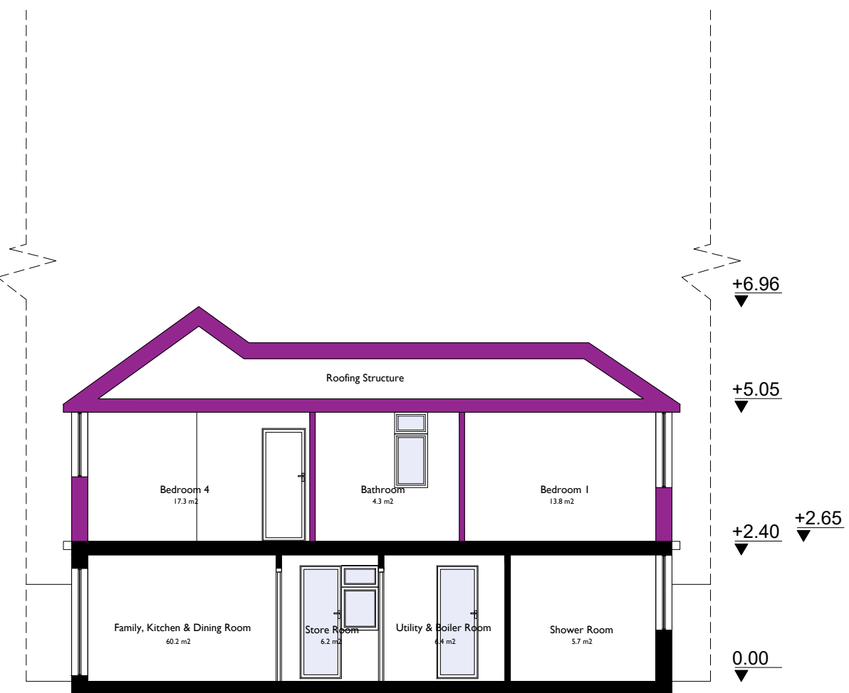
Proposed AA Section

Any dimensions shown should be checked on site. Designs are not coordinated with engineer projects. Not for construction purposes.