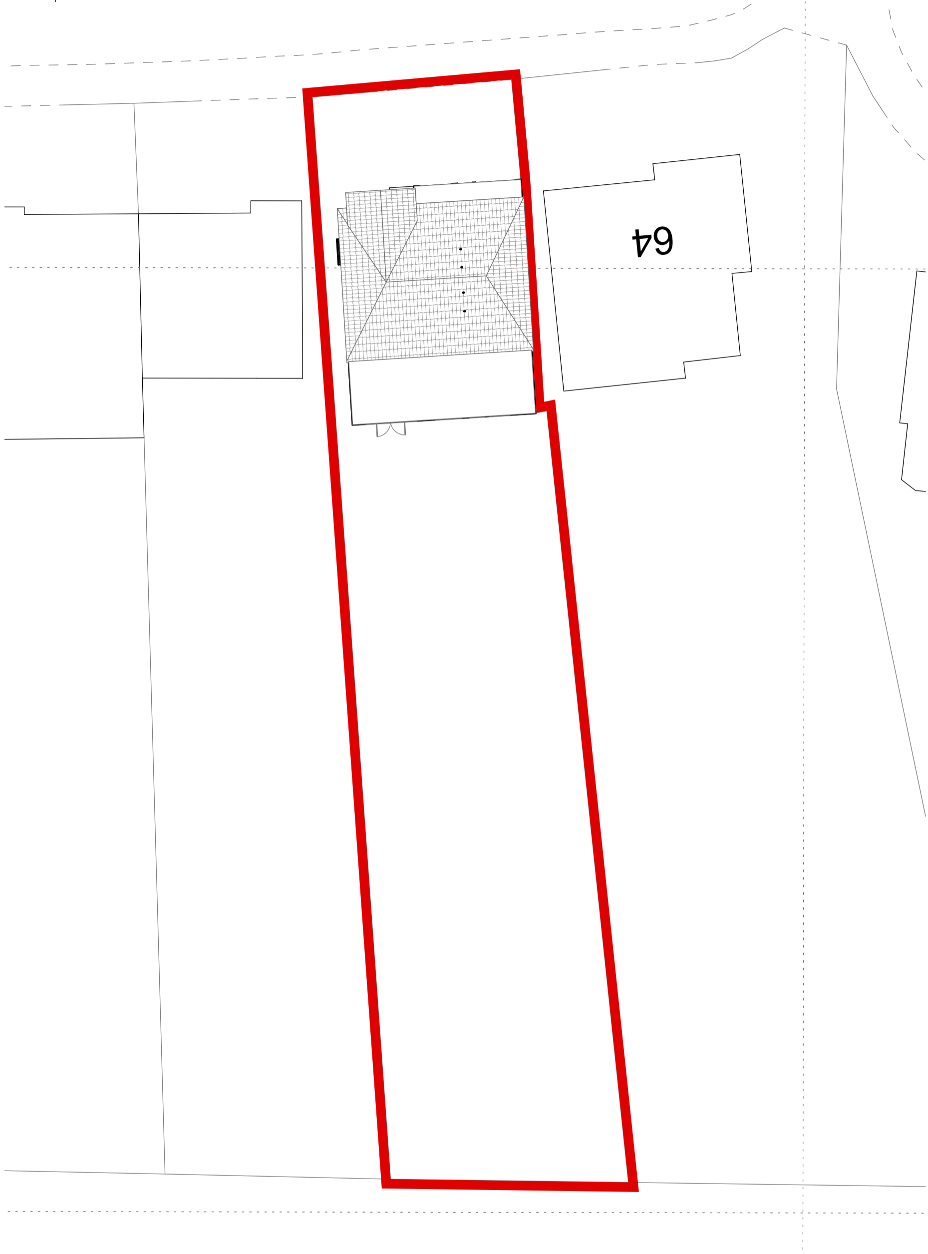
1 Site Plan 1:200