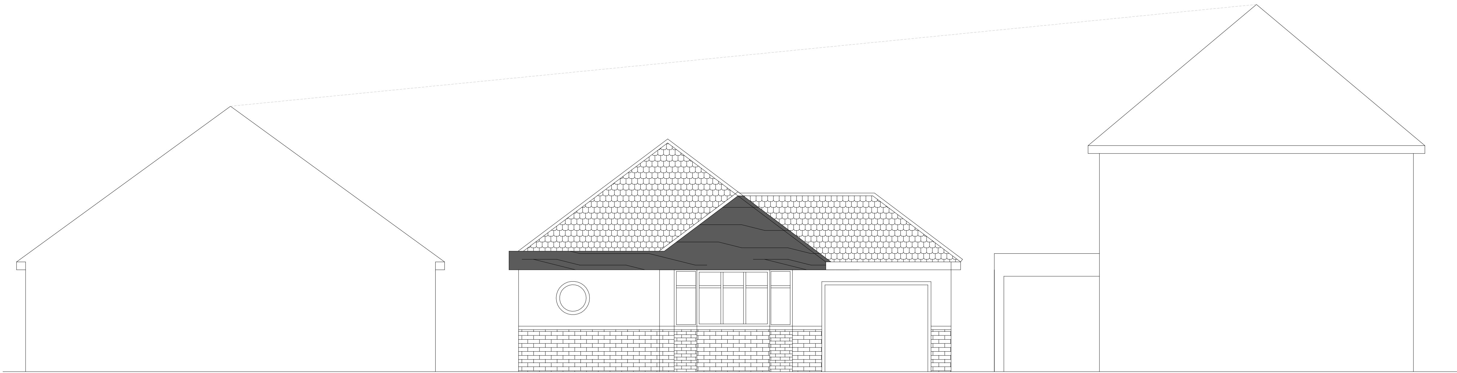
EXISTING FRONT ELEVATION (STREET SCENE)