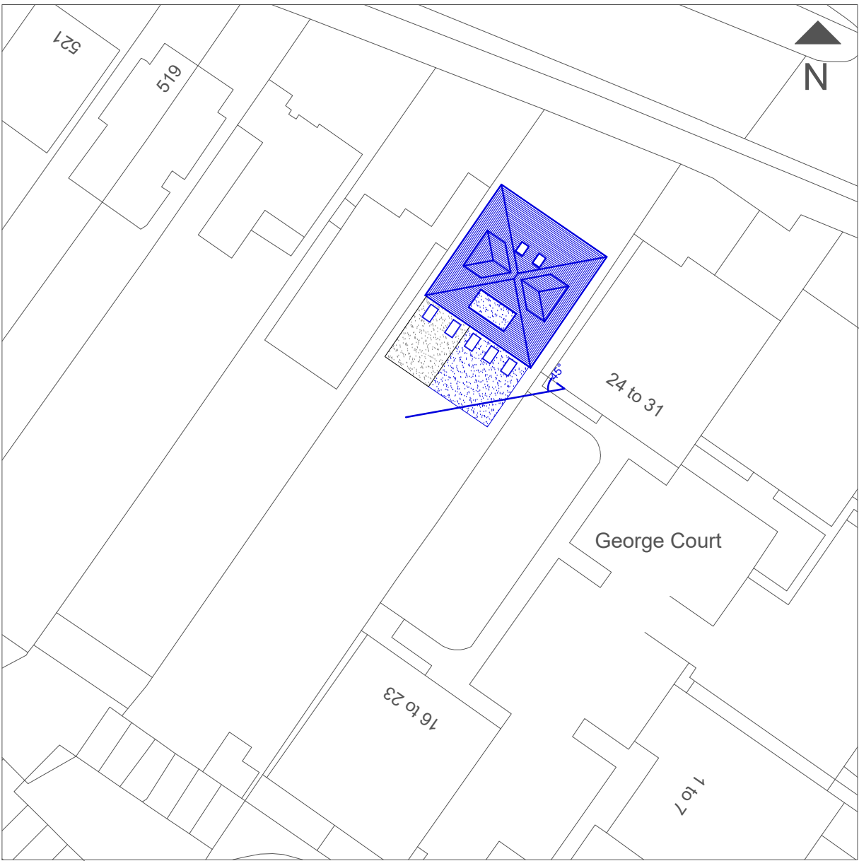
PROPOSED SITE PLAN (SCALE 1:500)