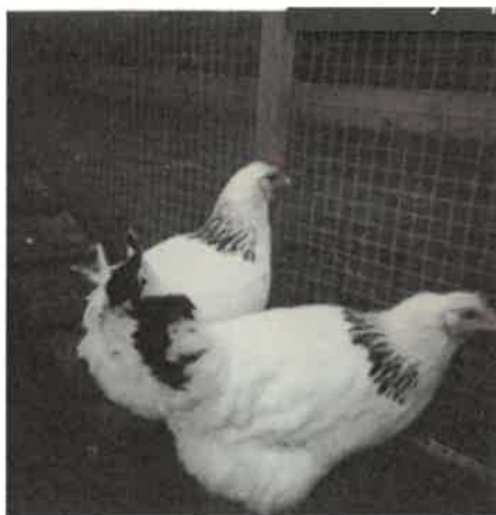
9 th Feb 2005