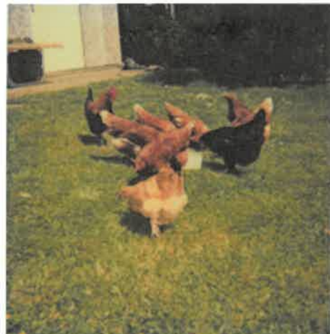
26 th June 2008