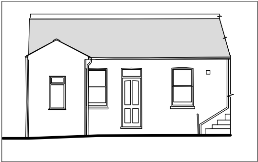
5 Proposed Elevation 2 1:50