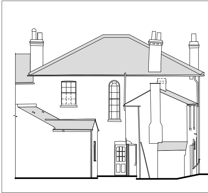
2 Proposed Rear Elevation 1:50