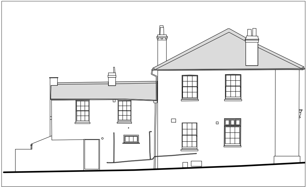
3 Proposed Side Elevation 1:50