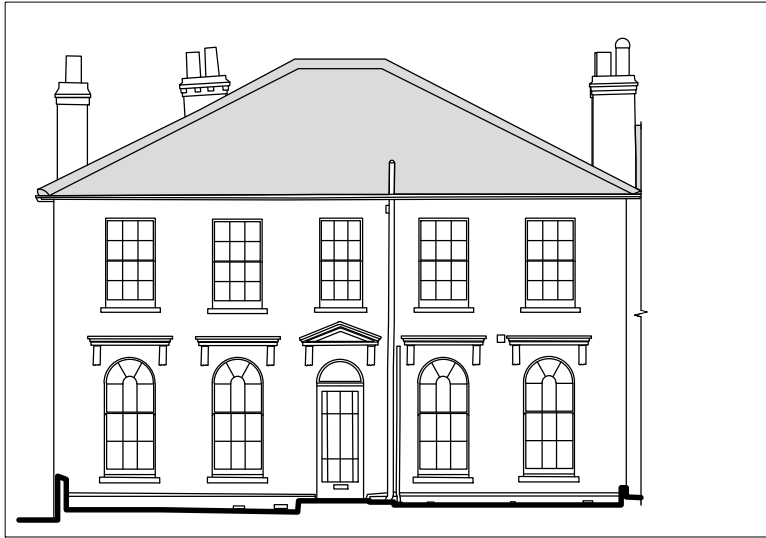
1 Proposed Front Elevation 1:50