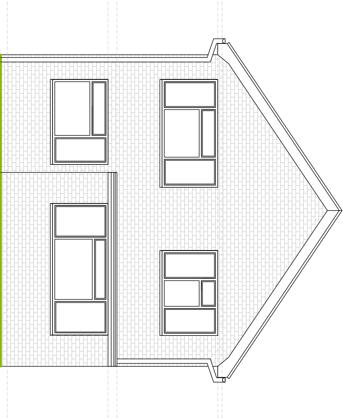
PROPOSED REAR ELEVATION SCALE BAR 1:50 @ A1