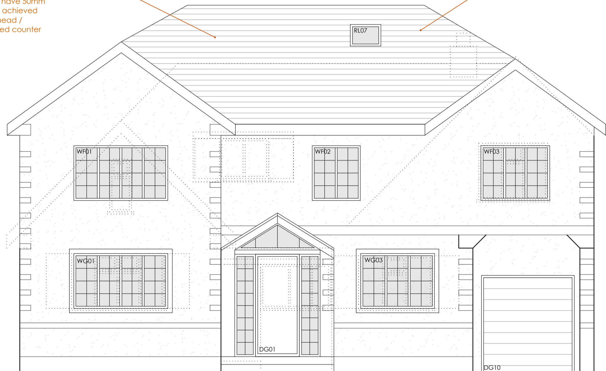
FRONT ELEVATION AS PROPOSED A1@ 1:50

Install new velux windows with flashing kits.