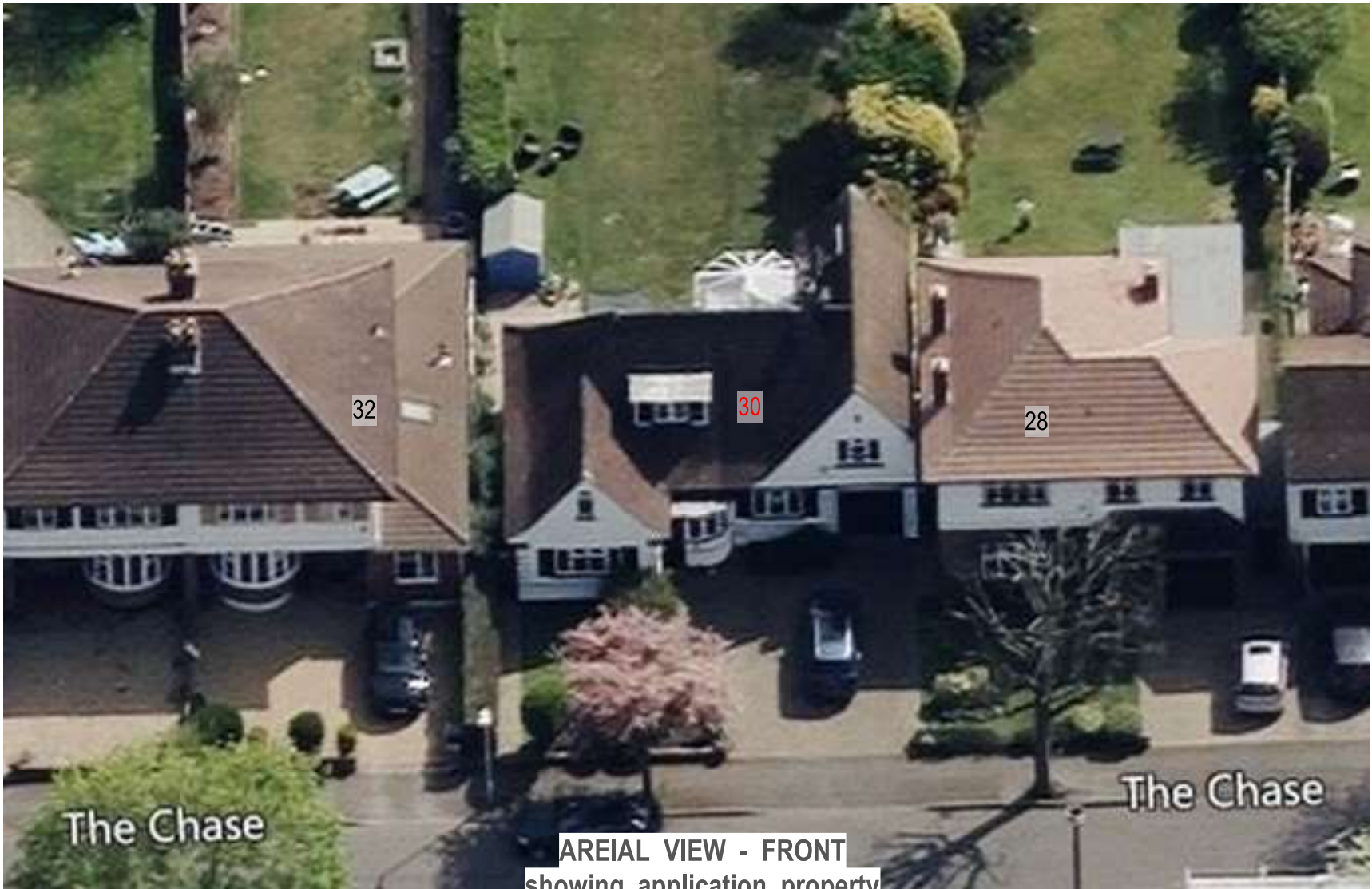
AREIAL VIEW - FRONT showing application property and neighbouring properties. Right hand side gable to be copied on left hand side