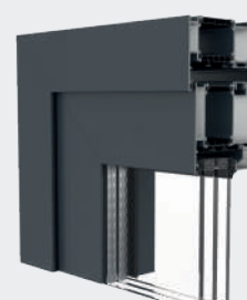
DOOR FRAME HEAD