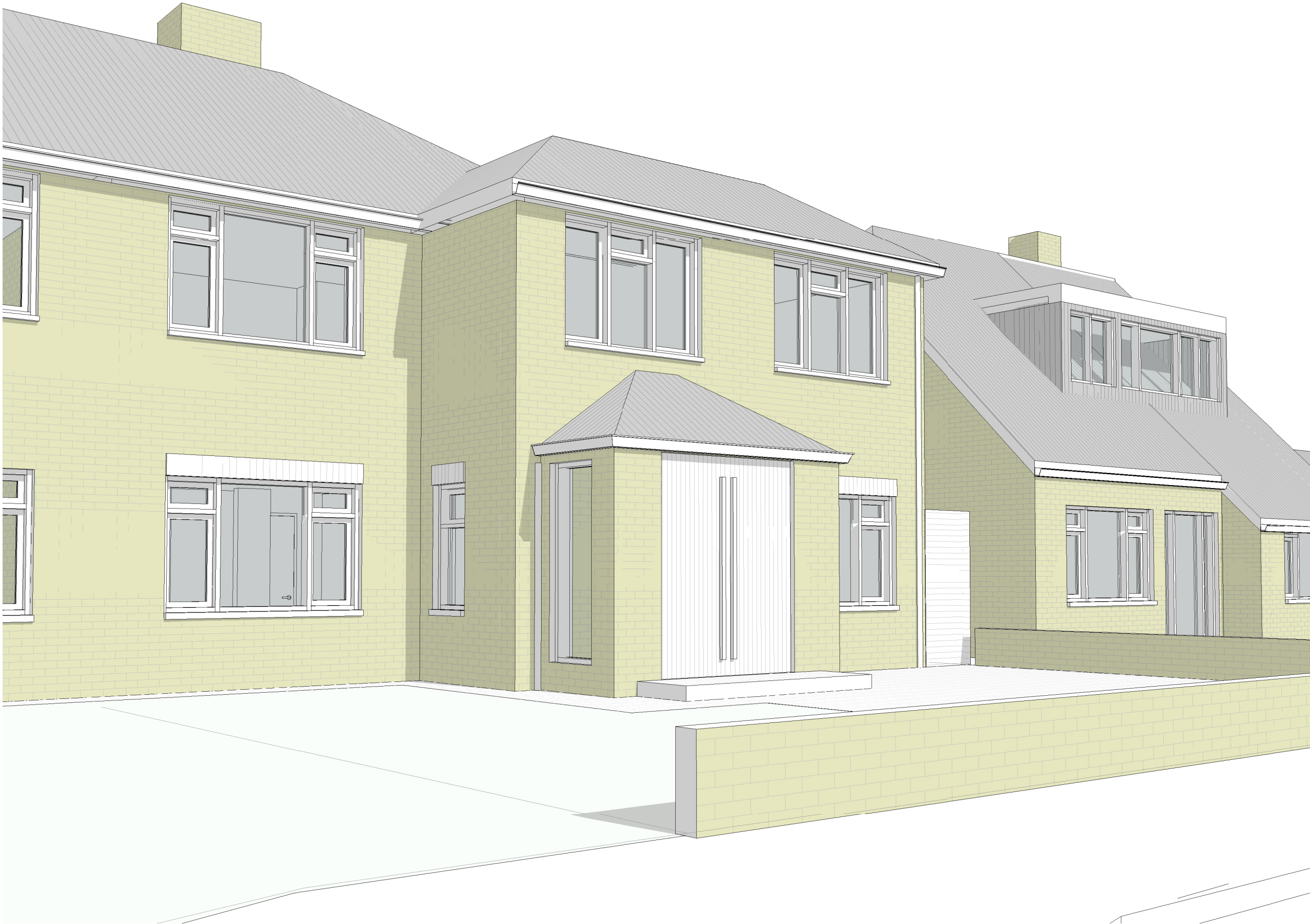
01 PROPOSED FRONT VIEW NTS @ A3