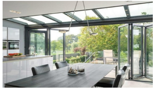
FIG 1: GLASS EXTENSION EXAMPLE