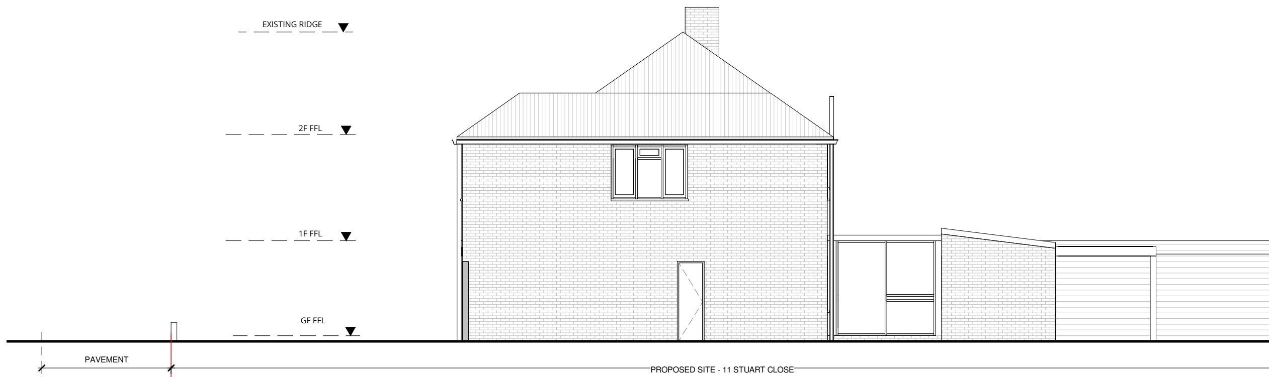
02 EXISTING SIDE / EAST ELEVATION 1:150 @ A3