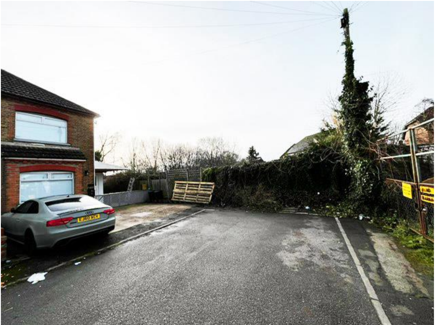
Photo 2: Front driveway at the end of the road – suitable for three point turn for smaller to medium size vehicles