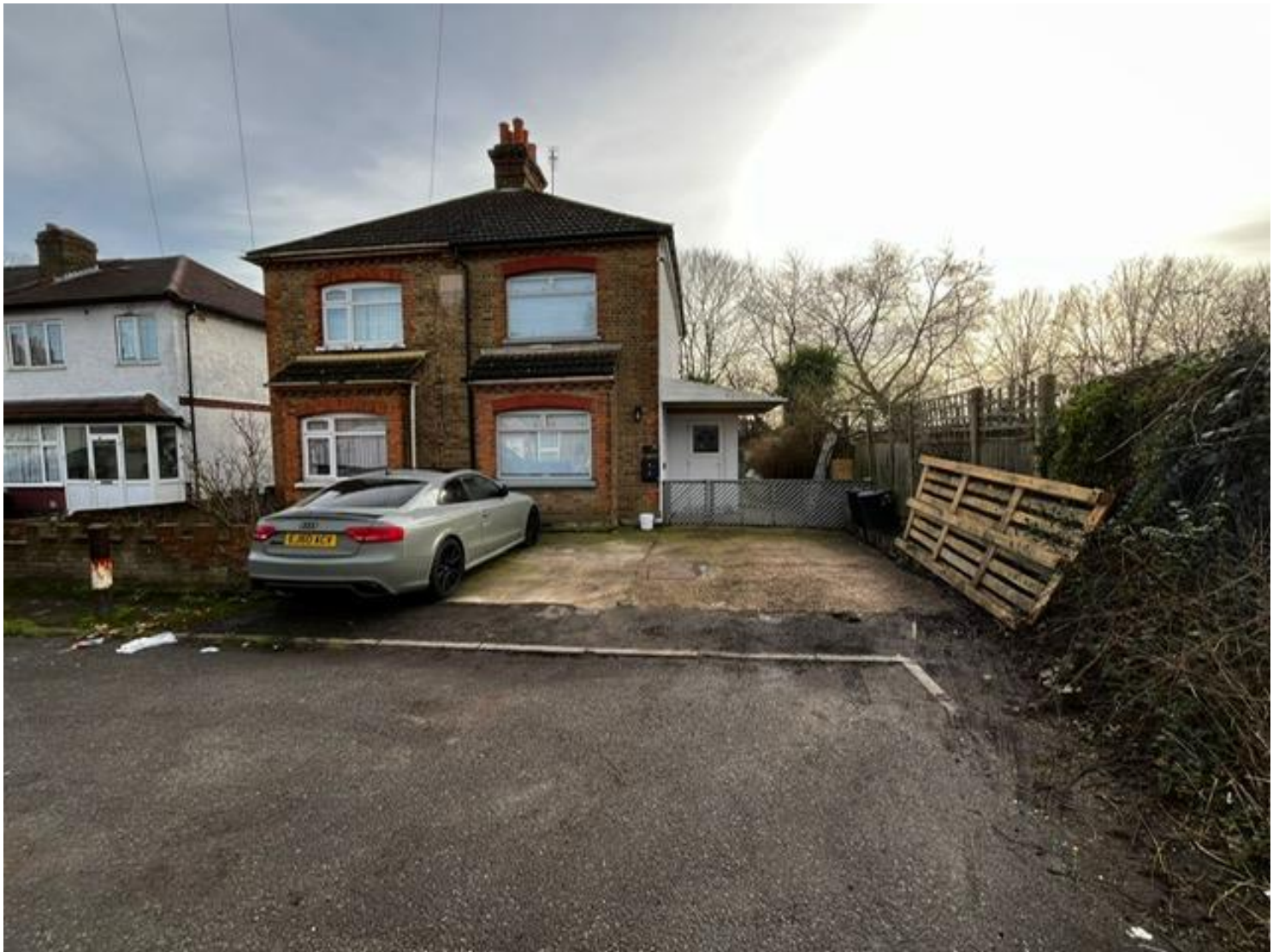
Photo 1: Streetscene showing access to the site with existing dropped kerb

The plot is of significant rectangular size (narrowing towards the rear) and forms approximately 14m long garden to the rear of existing house 23 Nellgrove Road. The site itself is relatively flat. Its boundaries are all well-defined with line of mature trees along south-east border. Its remaining boundaries are defined by 1.8m high close boarded wooden fence.