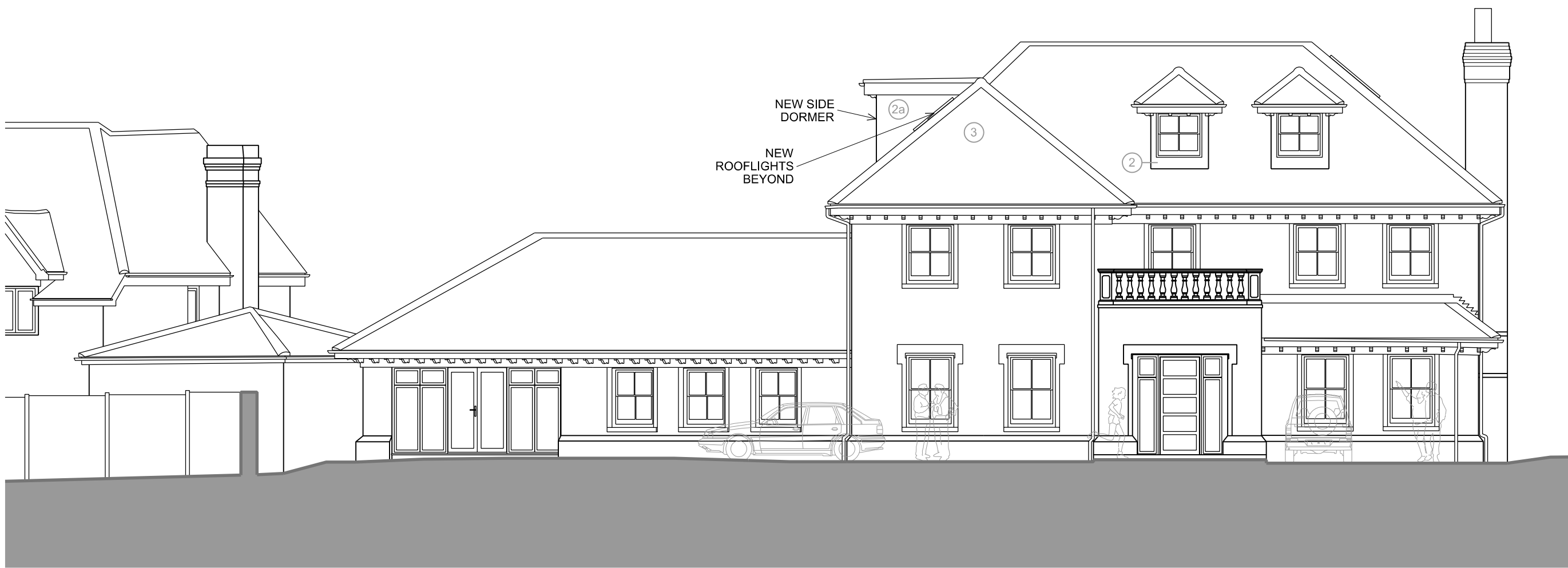
PROPOSED FRONT ELEVATION (NORTH WEST)