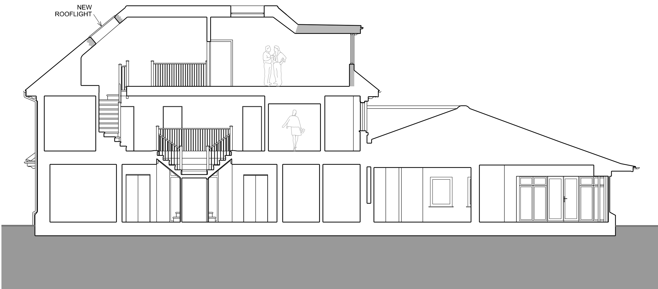
PROPOSED TYPICAL SECTION A-A