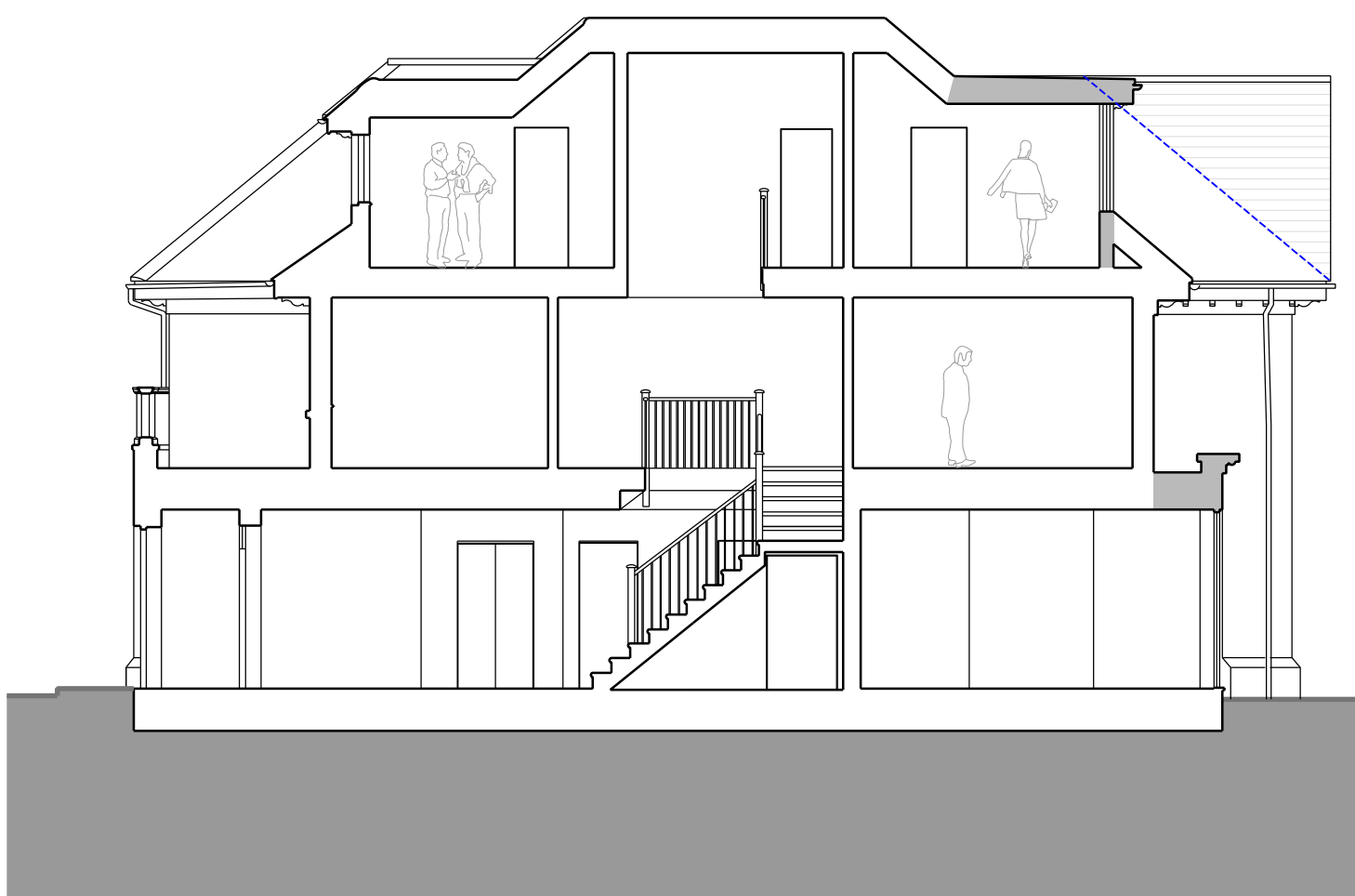
PROPOSED TYPICAL SECTION B-B