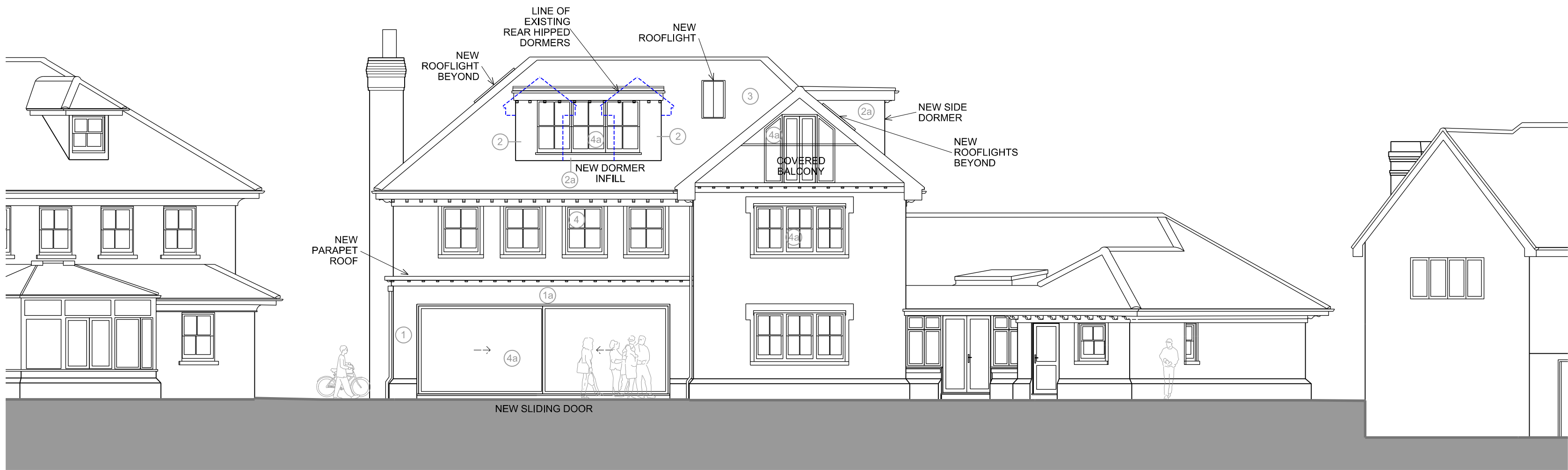
PROPOSED REAR ELEVATION (SOUTH EAST)