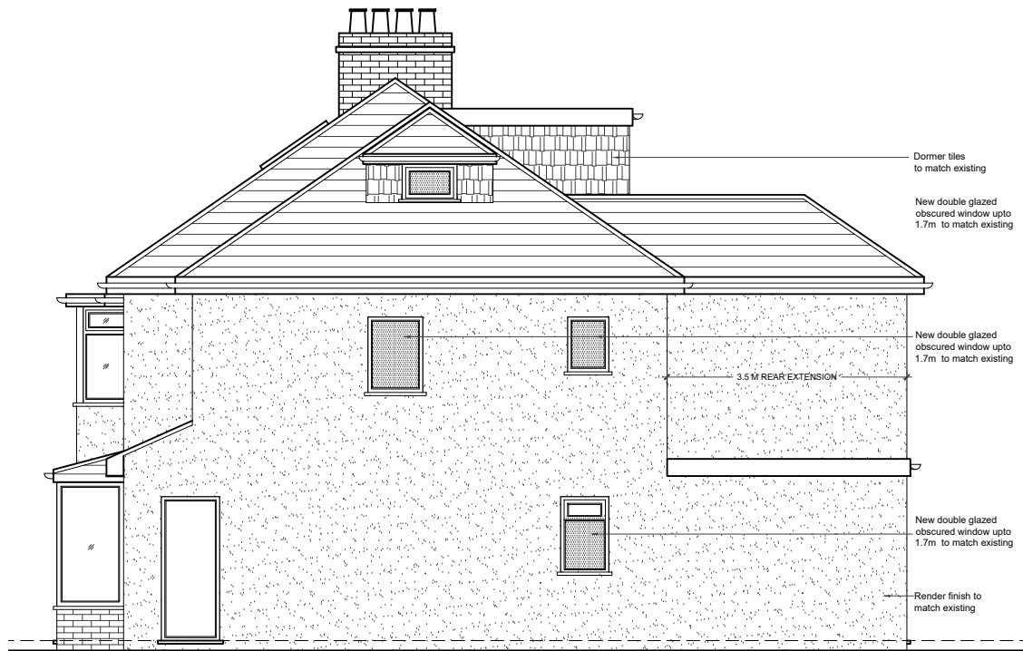
03 - SIDE ELEVATION