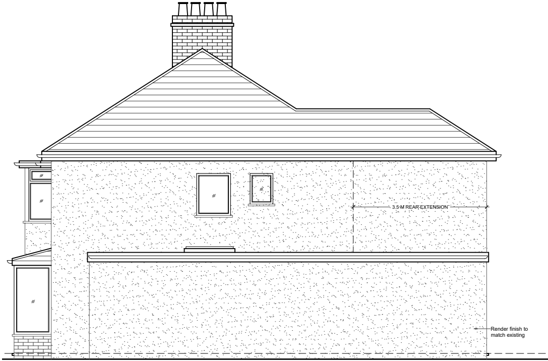
03 - SIDE ELEVATION